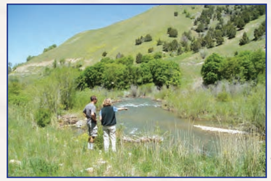
Project participants examine a restoration site.