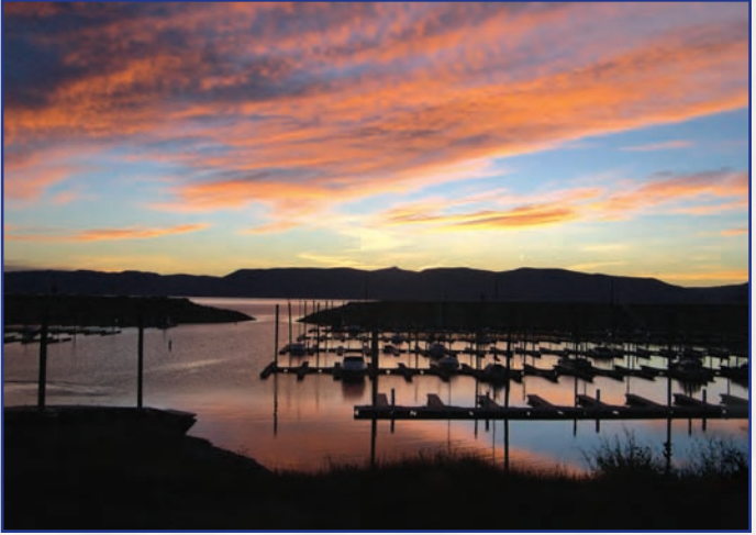
A late summer sunrise over the Bear Lake Marina. Bear Lake is the recreational gem of the watershed and provides opportunities from boating and camping to ice fishing.