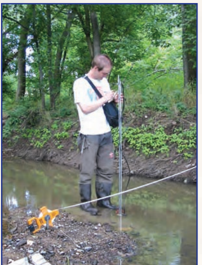
Illinois State Water Survey personnel monitor stream flow and water quality in the Upper Sangamon Watershed.

"The largest component of this grant is trying to improve the efficiency of nitrogen fertilizer management. We'll be working with University of Illinois researchers, Conservation Districts, farmers, and fertilizer dealers to test nutrient management measures and to use information technology. We hope to not only improve farm income, but improve water quality as well."