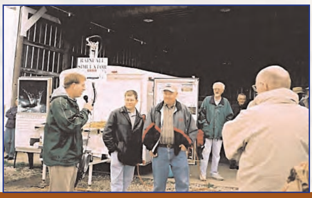
Macon County SWCD watershed tours educate urban and rural residents about conservation practices.