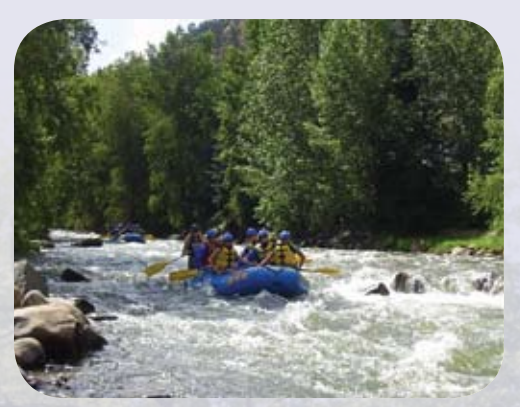
Rafters on Clear Creek.

The old Maud Monroe mine will be remediated and preserved as a historic mining tourism center.