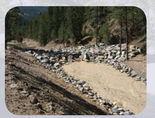
A sediment trap, which reduces metals and sediment flowing from orphan mine sites, is ready for clean out.