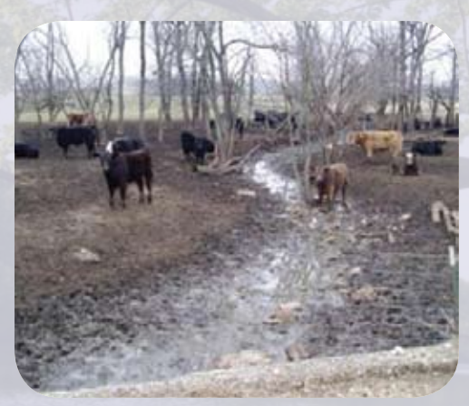
Cattle with unlimited access to streams will be addressed through Best Management Practices.