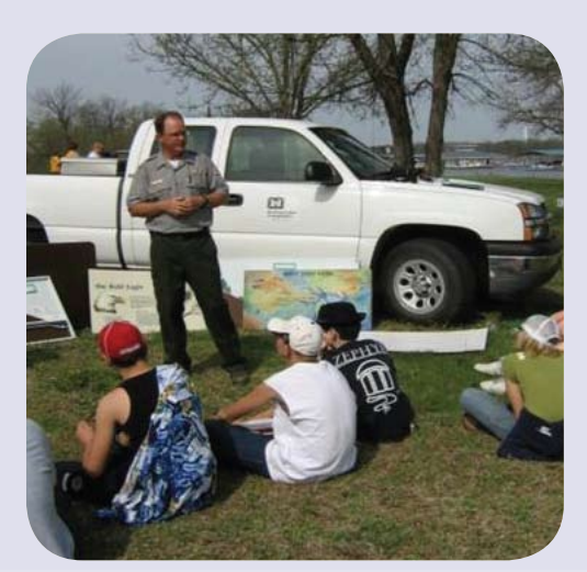
Watershed education activities at Hillsdale Reservoir.