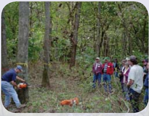
The basin forester works with landowners to maintain healthy riparian areas.