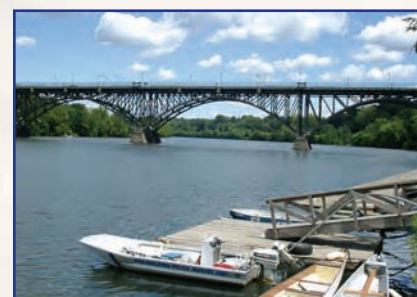
Various boats on the Schuylkill River along Boathouse Row near Philadelphia.

"This is a truly collaborative initiative, with thirteen organizations and agencies implementing 40 diverse projects spread throughout a watershed almost 2,000 square miles in size. The project managers are all committed and energized for putting the funds to work on the ground, and I'm excited to be part of making that happen."