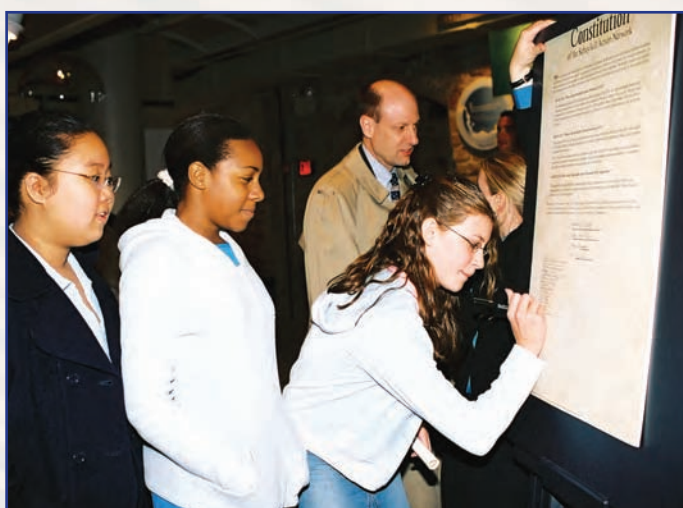
School children signing the Constitution of the Schuylkill Action Network (SAN), which is an agreement of watershed residents to join in the SAN's efforts to restore and protect the Schuylkill River.