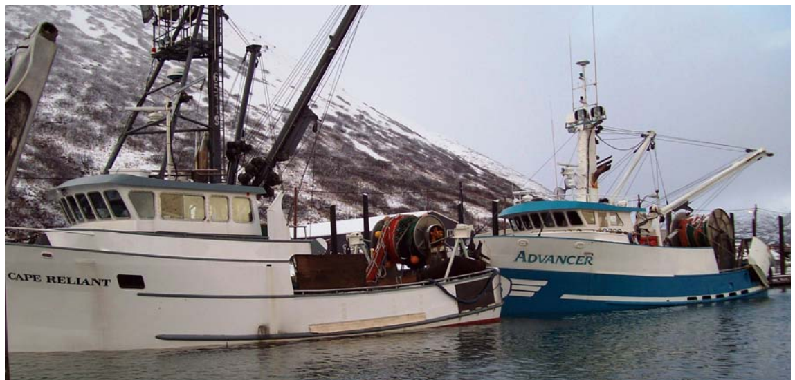
F/V Cape Reliant, F/V Advancer, King Cove