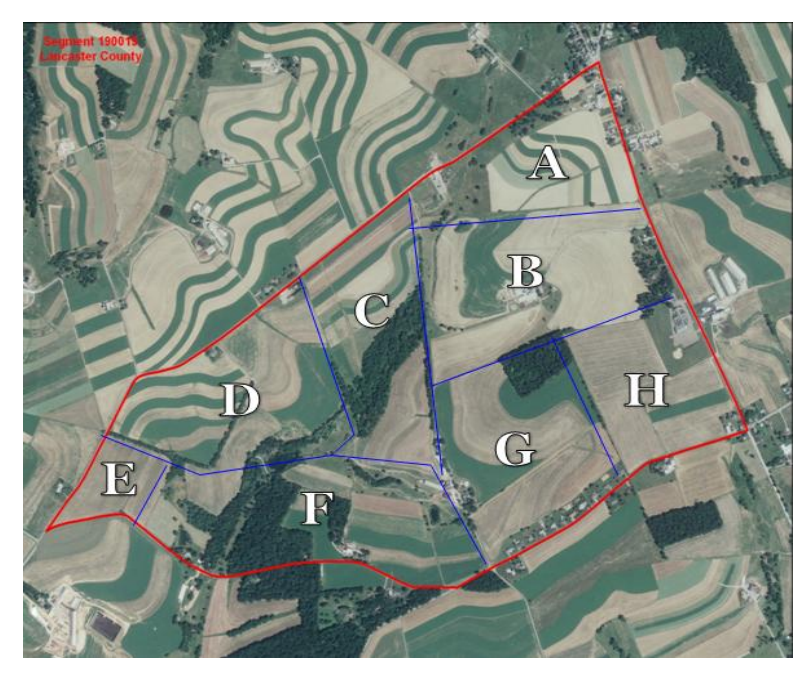
Figure 2: JAS Segment and Tract Boundaries.

A typical segment is about one square mile, which is equivalent to 640 acres. Each segment is outlined on an aerial photo which is provided to the appropriate field enumerator (See red outlined area in Figure 2).