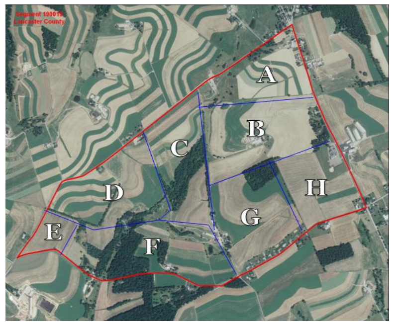
Figure 2: JAS Segment (outlined in red) and Tract Boundaries (outlined in blue)

Through field enumeration, a segment is divided into tracts of land, each representing a unique land operating arrangement (Refer to blue outlined areas in Figure 2). An area screening form is completed for all tracts within a segment and contains screening questions that determine whether or not each tract has agricultural activity. The screening applies to all land operated (both inside and outside the segment). Through this screening, any operation (tract) showing any potential for agricultural activities is subsequently interviewed using the area version questionnaire, which collects detailed agricultural information about the operator's land, again both inside and outside the segment.