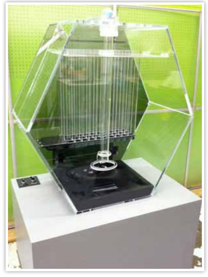
Custom TITAN Air Mix Ball machine commissioned by Selective Service System.

Garron is very proud to continue its service to the SSS, with its TITAN model. The TITAN is currently used by 14 lotteries in the USA, Africa, Asia and the Caribbean.