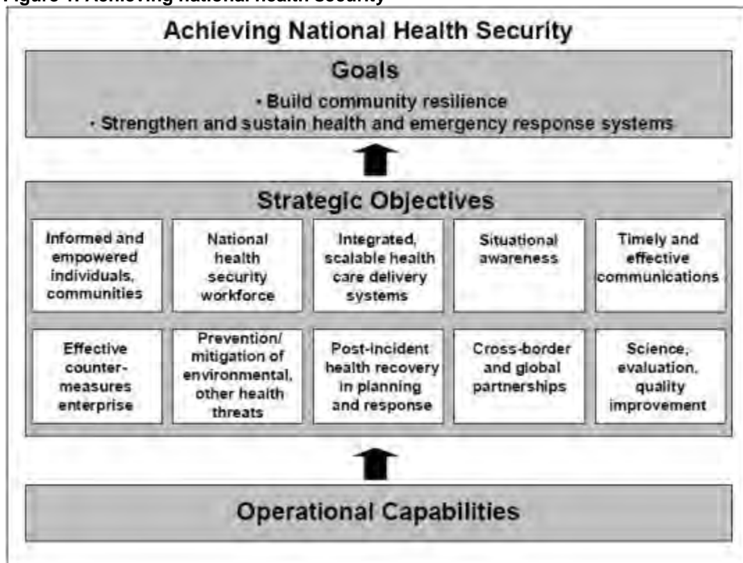
Figure 1. Achieving national health security

review are relevant to many of the other objectives (e.g., national health security workforce, effective countermeasures enterprise).