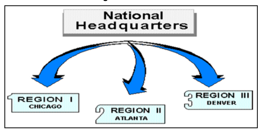
Figure 1 - Agency Structure

The current structure of the Selective Service System also includes three Region Headquarters. The National Headquarters and Region Headquarters make up the contingency of full-time employees of Selective Service. See Figure 1 below.