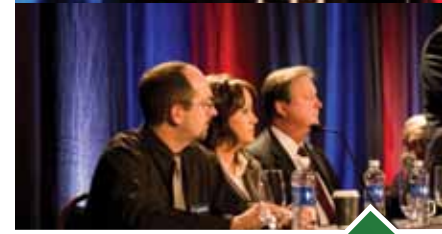
Crisis Communications Panel