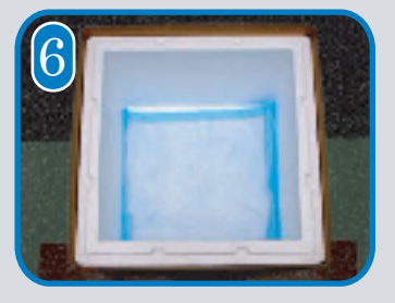
Use polystyrene foam-insulated, corrugated fiberboard shipper to ship boxes to CDC. Place absorbent material in the bottom of the shipper.