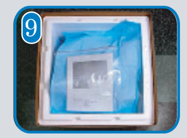
Place the blood shipping manifest in a sealable plastic bag and put on top of the sample boxes inside the shipper. Place lid on the shipper. (Keep your chain-of-custody documents for your files).

For questions concerning this process, please contact: