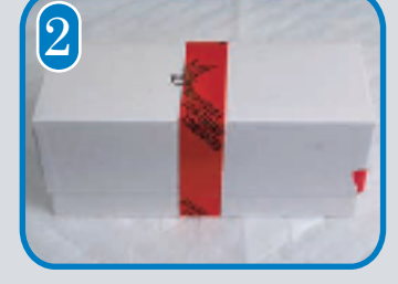
Seal gridded boxÅvith one continuous piece of evidence tap ^{k} The individual making the seal must initial half on the tape and half on the packaging.