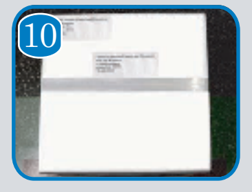
Secure the shipper lid with filamentous shipping tape. Place your return address in the upper left-hand corner of the shipper top and put the CDC Laboratory receiving address in the center.