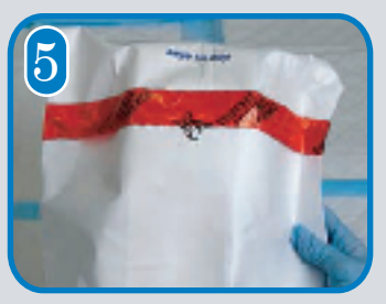
Seal the opening of this envelope with a continuous piece of evidence tape. Write initials half on the evidence tape and half on the envelope.