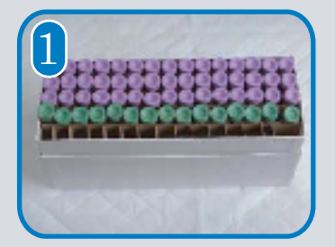
Place purple- and gray- or green top tubes by patient number into griddedtype box lined with an absorbent pad.

For detailed instructions see CDC's Shipping Instructions for Specimens Collected from People Who May Have Been Exposed to Chemical-Terrorism Agents.