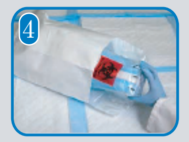
Place the sealed Saf-T-Pak inner leakproof polybag (or equivalent) inside a white Tyvek <sup>®</sup> outer envelope (or equivalent). Note: If primary receptacles do not meet the internal pressure requirement of 95 kPa, use compliant secondary packaging materials.