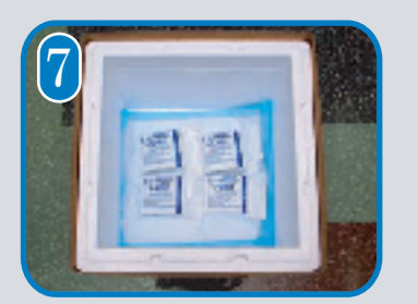
Place refrigerator packs in a single layer on top of the absorbent material.