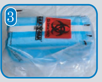
Wrap gridded box in absorbent pad and tape to seal. Seal gridded boxÁnsid^ a Saf-T-PakÁelear inner, leak-proof polybagÁorÁequivalent).