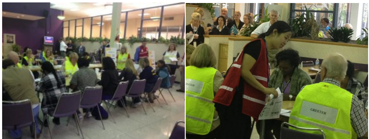
Cincinnati FEB Full Scale Federal Interagency Closed POD Exercise

In the event of an anthrax attack, points of dispensing (PODs) are operated in coordination with local public health officials to provide medical countermeasures (MCM) to a large number of people in an affected area. Several FEBs have collaborated with local health departments, the Centers for Disease Control and Prevention, GSA and Federal agencies to establish PODs in their Federal community.