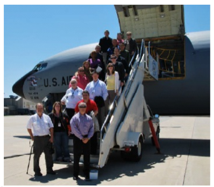
Oklahoma FEB Leadership Development Program Participants

FEBs identify and provide quality training opportunities, at low or no cost, to their Federal communities. Leveraging a large volume of multi-agency participants, FEBs obtain group rates achieving cost avoidance for their member agencies. Offering training options within the local commuting area further reduces costs associated with travel and lodging. In Fiscal Year 2012, FEBs provided training to 30,771 Federal employees at an estimated cost avoidance of $10,020,365.