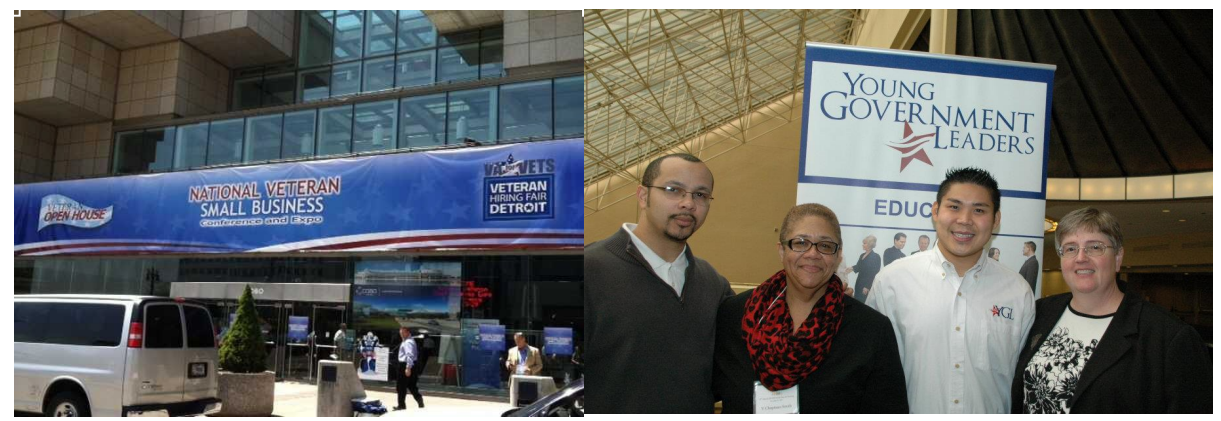
Detroit Veterans Affairs National Hiring Fair and Expo

Additionally, FEBs support a diverse Federal Government with targeted outreach to veterans and individuals with disabilities. Many FEBs support member agency diversity councils and events which foster awareness within their communities.