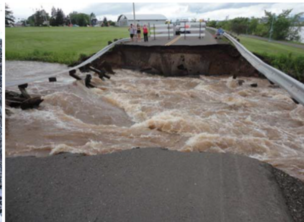
Oregon Winter Storm