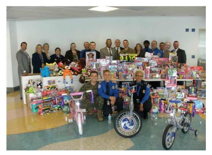
South Florida FEB Toy Drive

FEBs serve as focal points for Federal volunteer opportunities and community services. Examples include mentoring and tutoring programs with schools, blood drives, book collections, clothing drives, city and county community service projects, and holiday toy drives.