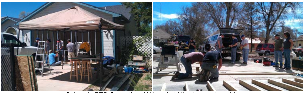
Colorado FEB Council and Wounded Warriors partnership

Another example of agency collaboration in the local community is the partnership that occurred between the Colorado FEB and the Wounded Warrior Program at Fort Carson, Colorado, that assisted a 90% disabled veteran. The FEB council solicited the donation of materials from community partners and remodeled the veteran's living space to make it more comfortable for him and his family.