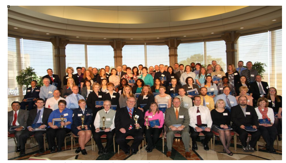
Minnesota FEB Civil Servant of the Year Ceremony

FEBs honor exceptional Federal service by hosting awards and recognition programs across the country. This year, FEBs presented 6,319 awards to Federal employees, acknowledging the value added to their communities as public servants. With over 16,750 attendees in Fiscal Year 2012, these recognition programs reward innovative efforts to advance the work of Federal agencies.