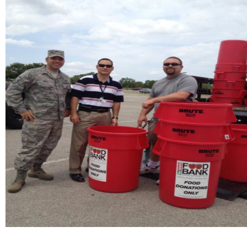
San Antonio FEB Feds Feed Families Food Drive