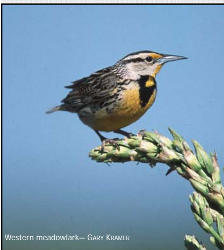
Western meadowlark— GARY KRAMER