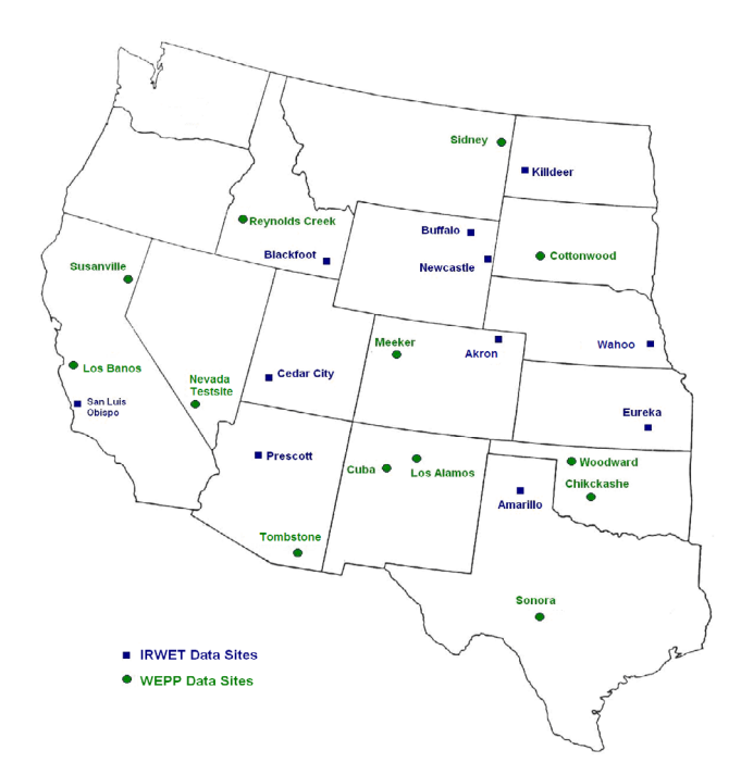
Figure 1. WEPP-IRWET data site locations.

The objective of this study was to develop an event-based runoff and water erosion model best suited for application to rangelands of the western U.S. We extracted algorithms from the process-based WEPP model, excluding relationships that were relevant only to cropland application, and incorporated relationships specific to rangelands. Rainfall simulation data collected on rangeland plots from the WEPP and IRWET (IRWET and NRST, 1998) projects were combined and analyzed, which together covered 49 rangeland sites distributed across 15 western states (fig. 1). Statistical analyses of these data form the basis of the parameter estimation equations for the primary infiltration and erodibility parameters of the model. A new splash erosion and thin sheet-flow transport equation specific for rangeland, developed based on the rangeland database (Wei et al., 2009), was incorporated. Sensitivity and uncertainty analyses were conducted for the code that was developed for the model (Wei et al., 2007; Wei et al., 2008). This article presents the overall conceptualization and structure of the RHEM model, a new system of parameter estimation equations specific to this model and based on the existing data, and results of model evaluation tests using independent measured data.