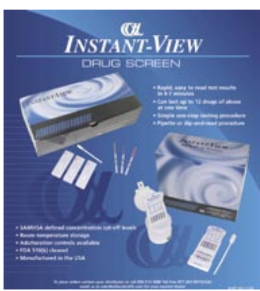
CDC Small Business Finance provided financing to Alfa Scientific Designs to purchase its new facility near San Diego. Alfa Scientific Designs develops one-step tests for pregnancy, allergies, cancer, drug abuse and infectious diseases.

The SBA 504 program helps participating small businesses purchase and occupy their buildings, facilitating business growth and creating jobs and investment in their communities. Through a partnership with hundreds of banks, small businesses receive up