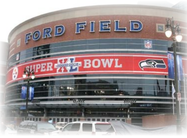
Super Bowl XL was held at Ford Field in Detroit, Michigan on February 5, 2006.

"Plainclothes officers assigned to Protective Intelligence partnered with federal or local officers to patrol high-risk venues covertly. Bomb Squad personnel responded to suspicious packages and provided Explosives K-9 sweeps of selected sites."