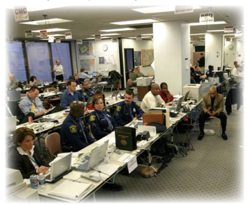
The Joint Operations Center (below), which was open from January 28 to February 6, included representatives from over 25 agencies.

The cooperation among the agencies at all levels helped to ensure the successful accomplishment of the security plan and highlighted the benefit of having a state police agency involved in this type of event.