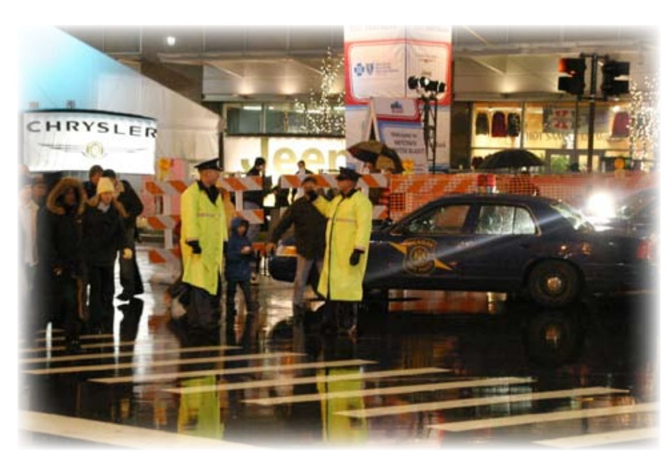
Michigan State Police troopers worked to ensure a safe and efficient traffic flow for all downtown visitors during Super Bowl XL.

To ensure an efficient and safe traffic flow, MSP troopers partnered with DPD officers on 12-hour shifts to work traffic points on surface streets and freeway ramps. Troopers also provided escorts for the teams, owners and visiting dignitaries. Both of these assignments, carried out in rain, snow, and extreme cold, were the most visible and, in many respects, the most important to the impression visitors had of the city and the