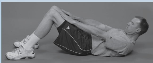
Figure 12. Curl Up: Place arms out toward the knees, tilt pelvis to flatten back. Raise head and shoulders from the floor. Hold for 5-10 seconds. Repeat 3 times.