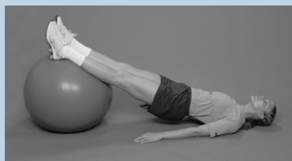
Figure 14. Supine Ball Extension: Place hands on the floor and raise hips from the floor. Hold for 5-10 seconds. Repeat 3 times.