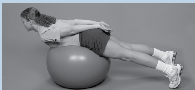
Figure 10. Face-Down Ball Extension: Place hands behind the back and lift head and shoulders upward. Hold for 5-10 seconds. Repeat 3 times.