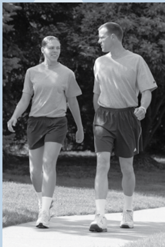
Figure 1. Walking: Begin with 10 minutes and increase to 30 minutes or more. Increase distance and pace as tolerated.

*See text for indications for each exercise.