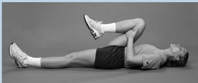
Figure 7. Single Knee-to-Chest: Pull one knee up to the chest and gently pull for 10 seconds. Repeat 3 times. Do this for each leg.