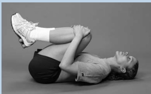
Figure 8. Double Knee-to-Chest: Pull both knees up to the chest and gently pull for 10 seconds. Repeat 3 times. Be sure pain is not getting worse. Unless pain is getting worse, perform 2-3 times per day.