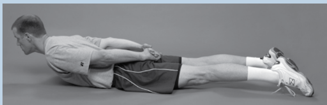
Figure 9. Face-Down Extension: Place hands behind the back and lift head and shoulders from the floor. Hold for 5-10 seconds. Repeat 3 times.