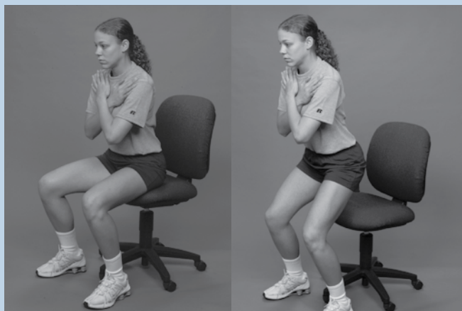
Figure 15. Chair Stand: Sit with arms across the chest; stand slowly and slowly return to seated position (count to 3 up and 3 down). Repeat 5-10 times.