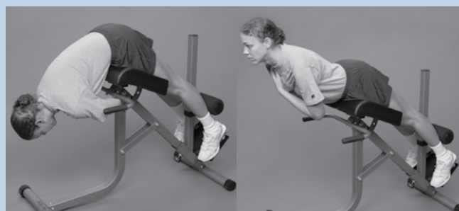
Figure 11. Roman Chair Extension: This is a more advanced exercise and may not be appropriate for everyone. Hip pad is placed at the crest of the hips. Bend forward as far as possible and lift the trunk using your low back muscles. Perform exercise slowly (3 count up and 4 count down). Repeat 5-10 times.