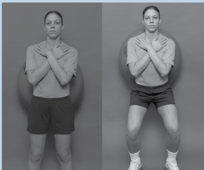
Figure 16. Ball/Wall Stand: Stand with straight knees and ball at your back. Bend knees slowly (3 second count) to three quarters position and hold for 5 seconds. Return to standing position slowly (3 second count). Repeat 5-10 times.