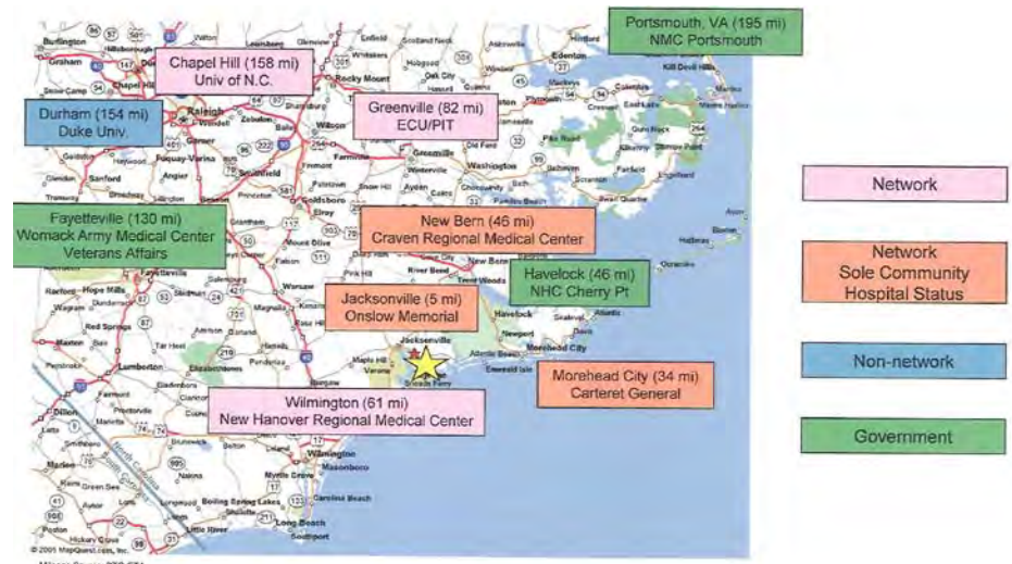
Figure 4. Naval Hospital Camp Lejeune Regional Referral Centers

Figure 4 shows the Regional Referral Centers utilized by Camp Lejeune and their distances from the base ranging anywhere from 5 to 195 miles.