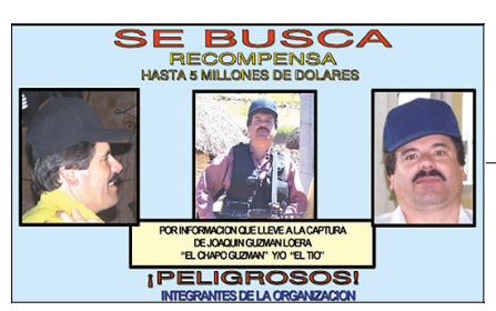
Mexico's Most Wanted Fugitive