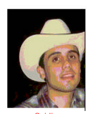
Ovidio GUZMAN LOPEZ DOB: March 29, 1990 Designated: May 8, 2012