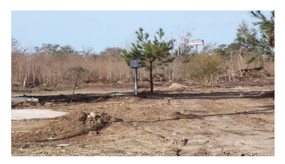
Figure 3: Grinder pump and control panel located at 150 Lady Mary in Henderson Point. The grinder pump is not currently attached to a residence.

Henderson Point-Pass Christian Isles Water and Sewer District NR. 1, Inc. ordinance, amended as of December 28, 2007, states, "property owners shall notify the District a minimum of 30 days prior to needing the installation." The District did not determine whether residents were moving back to the area before giving the contractor