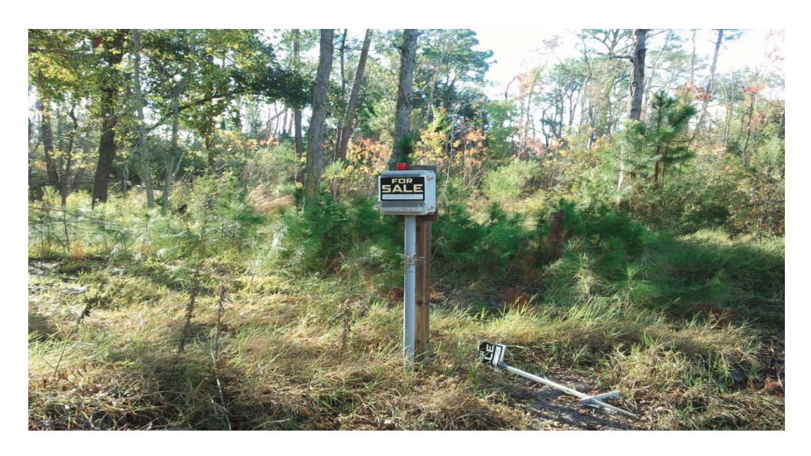
Figure 2: Grinder pump and control panel located at 300 Audubon Lane in Henderson Point. The grinder pump is not currently attached to a residence. Source: OIG site visit (December 8, 2011).