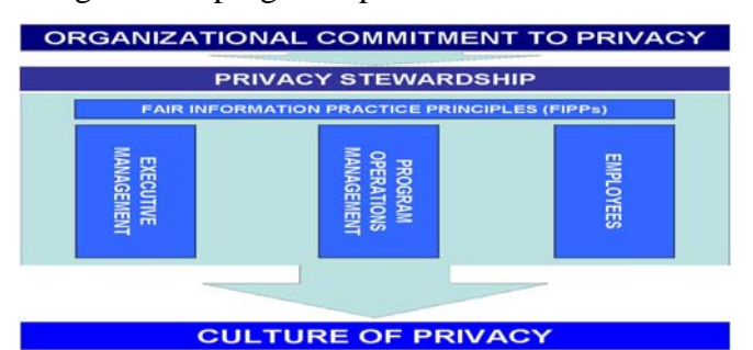
Figure 2. Pillars of Privacy Stewardship

As illustrated in figure 2, the level of organizational commitment to privacy accountability drives the expectations for privacy stewardship at executive management, program operations management, and employee levels. Effective privacy stewardship includes (1) ongoing privacy risk assessment and mitigation; (2) standardized procedures that implement the FIPPs and other requirements; and (3) established privacy conduct, training, and safeguards in program operations.