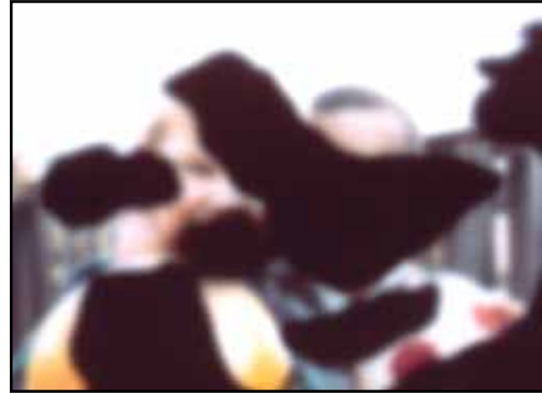
Same scene viewed by a person with diabetic retinopathy.