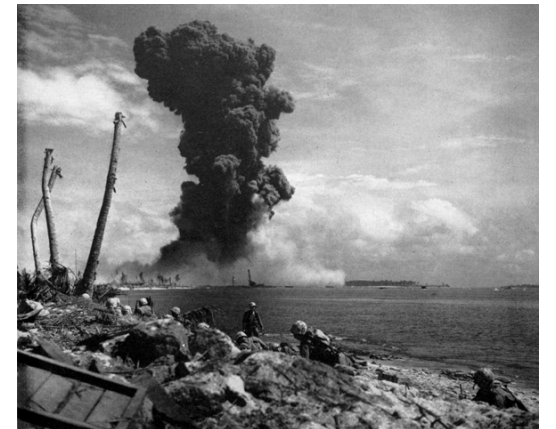
Explosion at Ammunition Storage Facility

STOP #11 NADINE POINT - You are entering the Japanese defensive position code-named Nadine Point by American intelligence officers. The entire area was a honeycomb of interconnected trenches. These trenches, designed to provide support and communications to the large blockhouse, were discovered in 1995 during an archaeological survey of the island. The battleship U.S.S. Maryland provided fire-support to the Marines and many of the marks on the pillbox are from the Maryland's projectiles. Walk around the structure and move south on the dirt road next to the shoreline, then stop at the air raid shelter on your right.