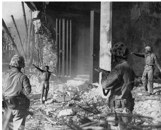
The Ammunition Storage Building as it appeared during the battle

STOP #13 AMMUNITION STORAGE BUILDING - The ammunition bunker you see is identical to the one that caused the large explosion (described in stop 10) and the delay in the advance. As you walk around the building notice the marks from the small arms fire and the heavy projectile penetration of the building. When you come upon the double door, look for the holes burned through the iron doors, most likely by high explosive anti-tank rockets fired from a 2.36-inch bazooka. Proceed on Surf Road and turn left on a dirt road and move to the intersection of ALTAIR Road.