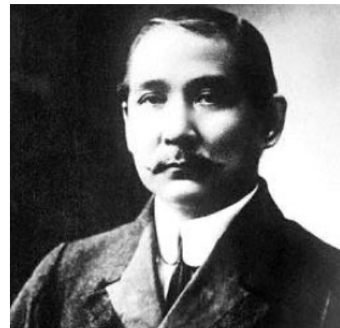
Dr. Sun Yat Sen, founder of the Chinese Republic