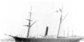
Logbook fragment of the U.S. revenue cutter Rush (1874-1912), whose logbooks have been digitized and their historic weather observations transcribed by volunteers. Also shown: Rush at anchor, n.d.