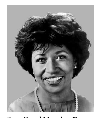
Sen. Carol Moseley-Braun of Chicago Democrat—Jan. 3, 1993