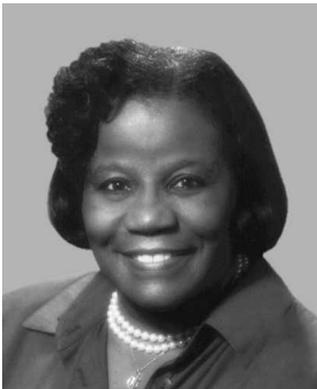
Carrie Meek of Miami (17th District) Democrat—3d term