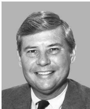
Sen. Bob Graham of Miami Lakes Democrat—Jan. 3, 1987