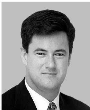
Joe Scarborough of Pensacola (1st District) Republican—2d term