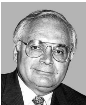
Michael Bilirakis of Palm Harbor (9th District) Republican—8th term