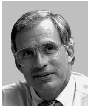
Porter J. Goss of Sanibel (14th District) Republican—5th term