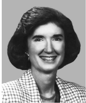
Tillie Fowler of Jacksonville (4th District) Republican—3d term