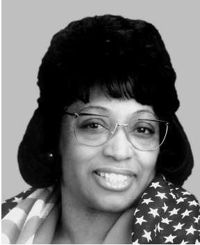
Corrine Brown of Jacksonville (3d District) Democrat—3d term