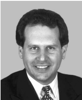
Lincoln Diaz-Balart of Miami (21st District) Republican—3d term