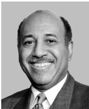
Alcee L. Hastings of Miramar (23d District) Democrat—3d term