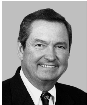
E. Clay Shaw, Jr. of Fort Lauderdale (22d District) Republican—9th term