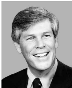
Sen. Connie Mack of Cape Coral Republican—Jan. 3, 1989