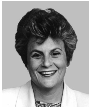
Ileana Ros-Lehtinen of Miami (18th District) Republican—5th term