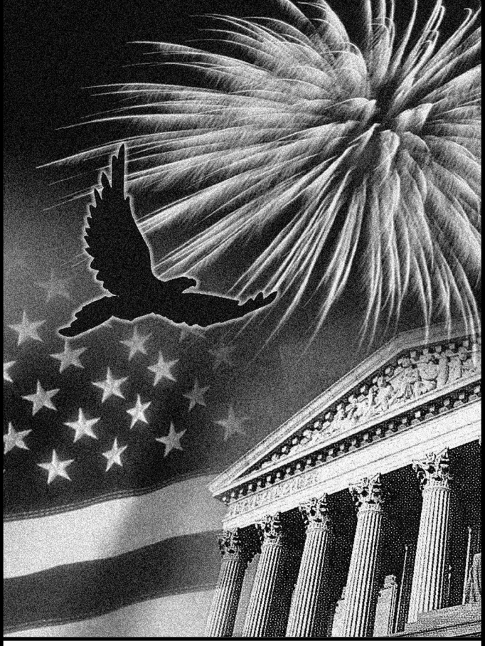
Get forms and other Information faster and easier by: Internet IRS.gov