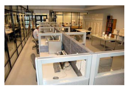
NARA Atlanta Research Room