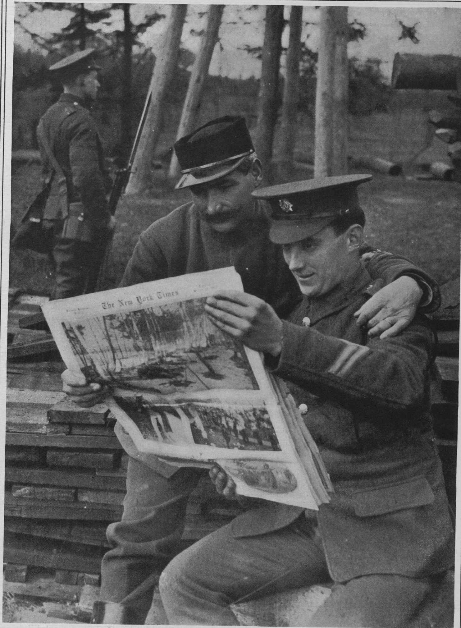
A FRENCH NON-COMMISSIONED OFFICER AND HIS BRITISH ALLY, AT THE FRONT IN NORTHERN FRANCE, READING A COPY OF THE PICTURE SECTION OF THE TIMES OF SUNDAY, MARCH 14, LAST.