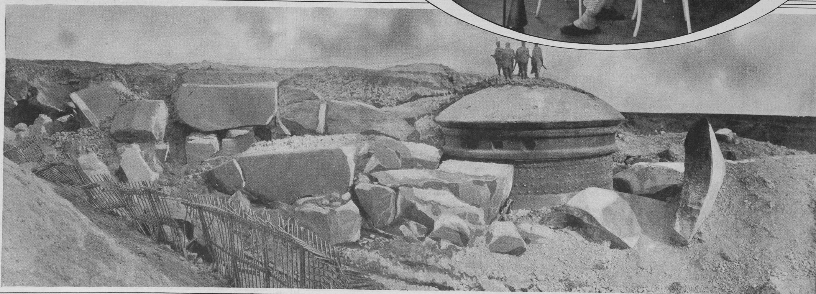
THE MASONRY OF THE FORT AT MANONVILLIER, FRANCE, CRUMPLED BY GERMAN SHELLS.