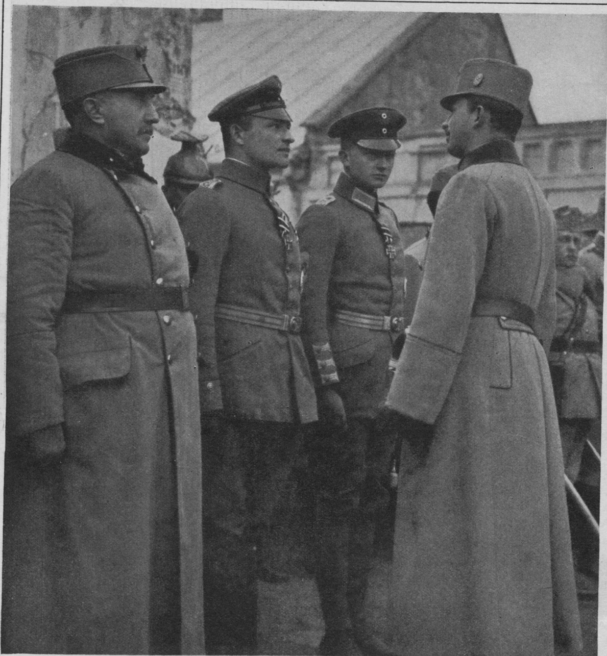
ARCHDUKE KARL FRANZ JOSEF, HEIR TO THE AUSTRIAN THRONE, IN CONVERSATION WITH TWO GERMAN OFFICERS OF AN AVIATION DIVISION WHO HAVE JUST BEEN DECORATED.