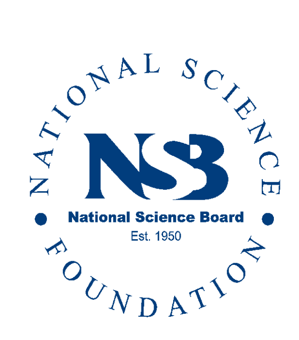
May 7, 2007