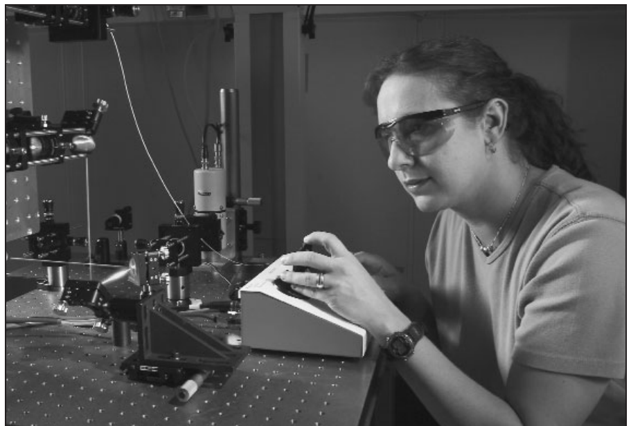
NIST physical scientist positions a tissue-engineering polymer scaffold sample for imaging with a new dual microscope system.