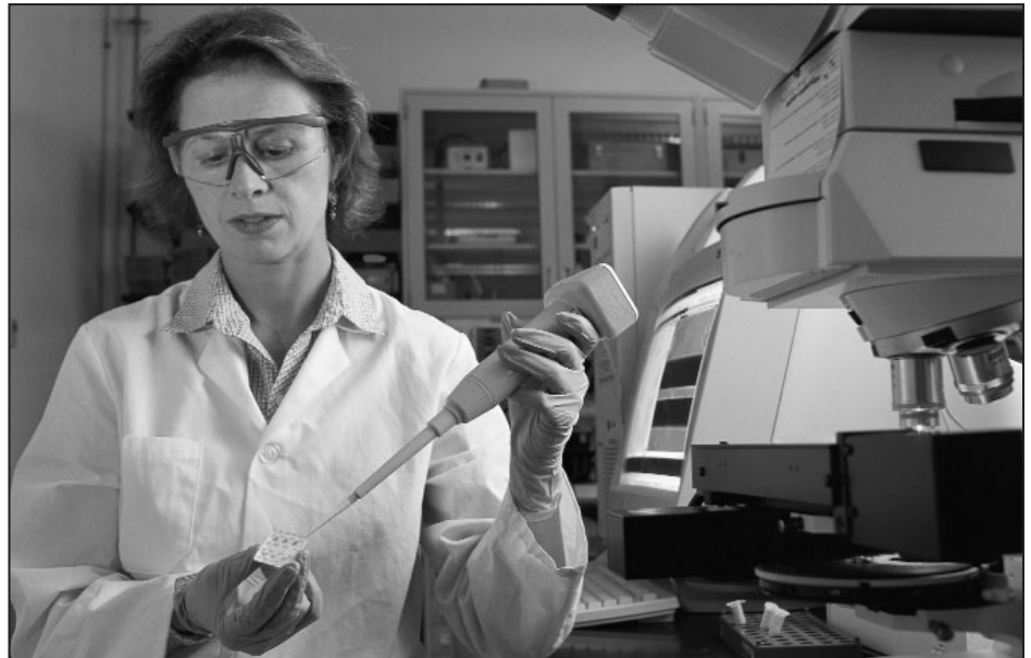
NIST biomedical engineer places a water sample on a tiny sensing chip that detects toxic chemicals.

The Committee understands and appreciates the management emphasis on safety but is concerned that this emphasis has not been entirely embraced by the staff. A plan should be developed to include the staff in actively reducing the reportable injury rates. The Committee observes that there are inconsistent practices for wearing personal safety protection equipment. Further, not all injuries may be reported; there is no mechanism to evaluate this potential problem. Some suggested steps are to implement a hazard identification system and to reinforce positively the reporting of incidents.