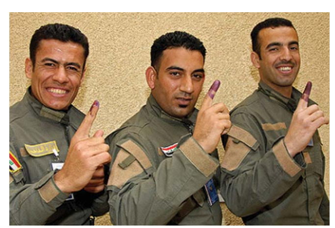
Iraqi Police officers in Tikrit show their ink-stained index fingers after an early-voting session for election-support personnel on March 4, 2010.

The fundamental question of who will form and lead Iraq's next government remains unanswered. Iraq's Higher Judicial