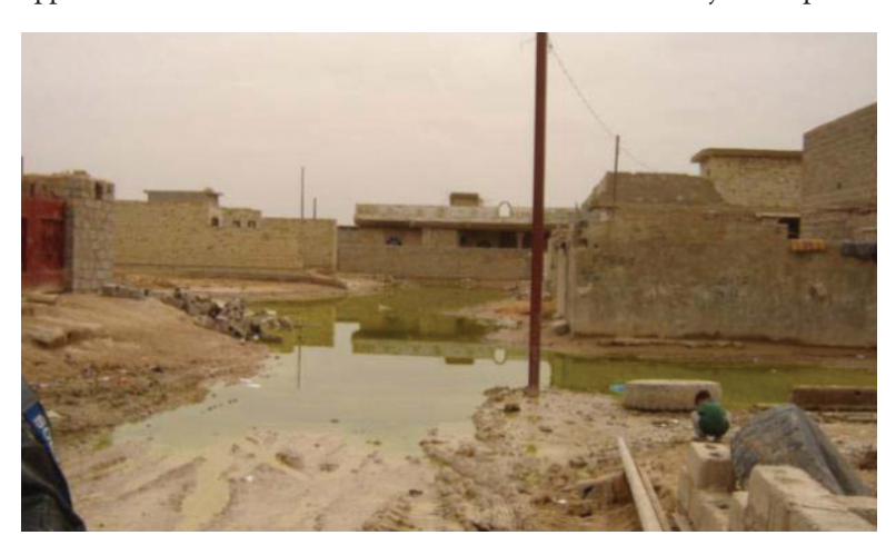
Raw sewage in the streets of Falluja, 2004.

approached the GOI and asked what could be done in Falluja to help