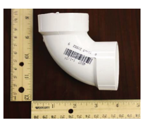
Anham billed the government $80 for a 1.5" x 4.0" 90-degree PVC elbow.

The Defense Contract Management Agency (DCMA) reviewed and recommended approving Anham's purchasing