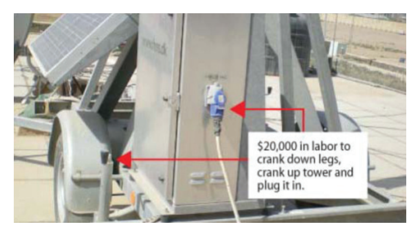
Anham, through the contractor Knowlogy, billed $20,000 for installation of a "Plug and Play" Voice System.

appropriate. In some instances, invoices were reviewed months after they were paid. Poor or delayed invoice reviews increase the risk that the government may overpay or pay unallowable and unreasonable costs.