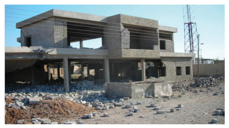
Bombed Hai al-Intisar Primary Healthcare Center.

absence of a central database of reconstruction and stabilization casualties made an exact calculation impossible.