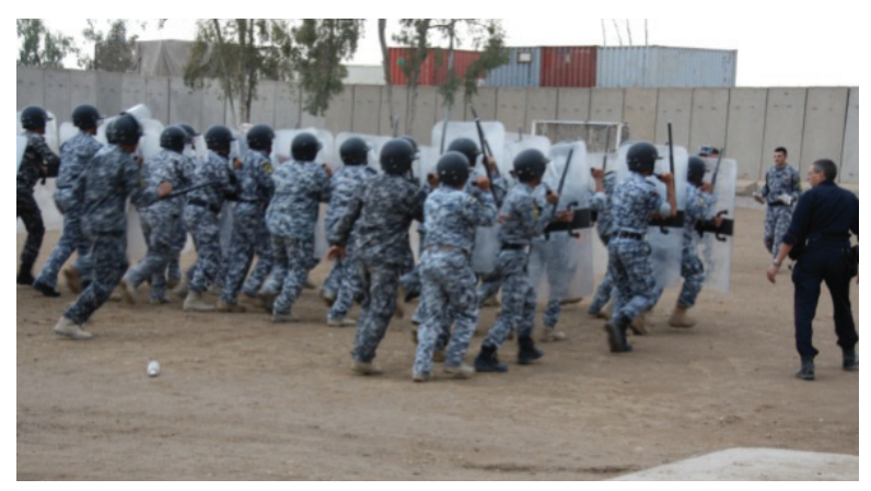
Riot-control training for Iraqi police forces, April 2010.

Today, a majority of CERP funds are spent on ... projects that, while important, far exceed the intended scale and scope of urgent projects CERP was intended to support. Over the last five years, CERP has grown from an incisive [counterinsurgency] tool to an alternative U.S. development program with few limits and little management.