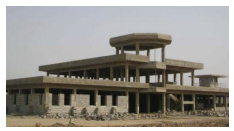
Khan Bani Sa'ad Correctional Facility abandoned after approximately $40 million had been spent.