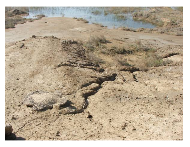
Site Photo 16. Surface erosion of canal banks at km 188 repair area