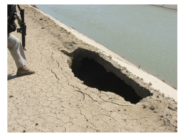
Site Photo 7. Example of under-cutting of canal