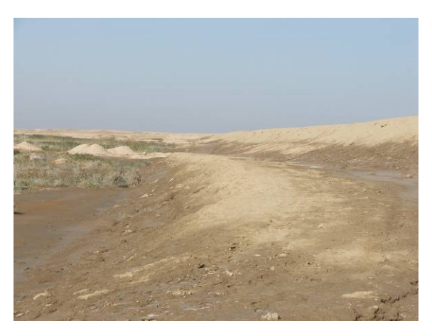
Site Photo 15. km 188 repair area