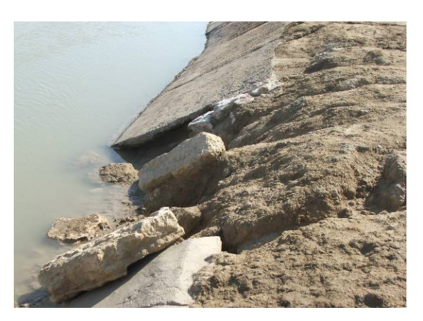
Site Photo 13. Example of concrete liner failure at km 168 repair area