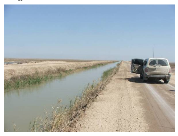
Site Photo 18. Unlined portion of SWC

Site Photo 18 shows an example of the unlined section of the SWC, Site Photo 19 shows recent tire prints from a heavy equipment vehicle, and Site Photo 20 shows dredge spoils located parallel to the canal. Site Photo 21 shows sluice gates used to control water at the entrance of the settling basin and Site Photo 22 shows the settling basin.