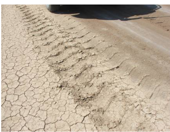
Site Photo 19. Recent tire tracks from heavy equipment vehicle