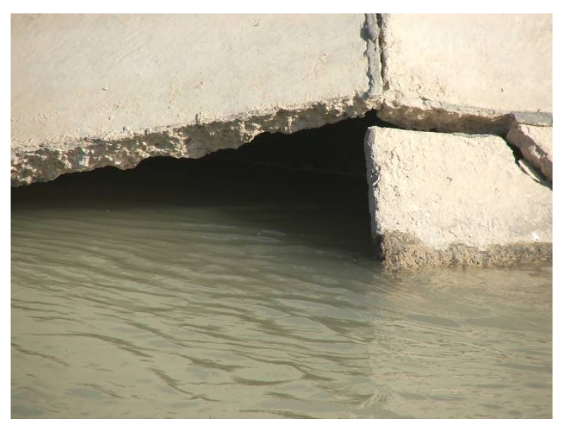
Site Photo 17. Example of under-cutting of canal sidewall in vicinity of km 188