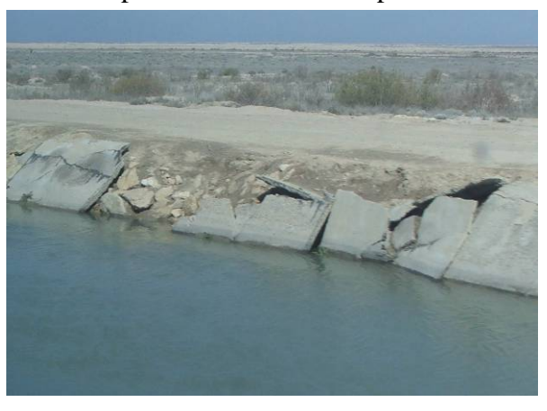
Site Photo 6. Example of concrete liner failure