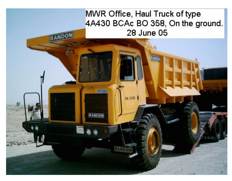
Site Photo 1. Haul truck purchased through PCO