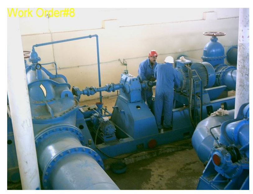
Site Photo 3. Pumps located at Pump Station #2