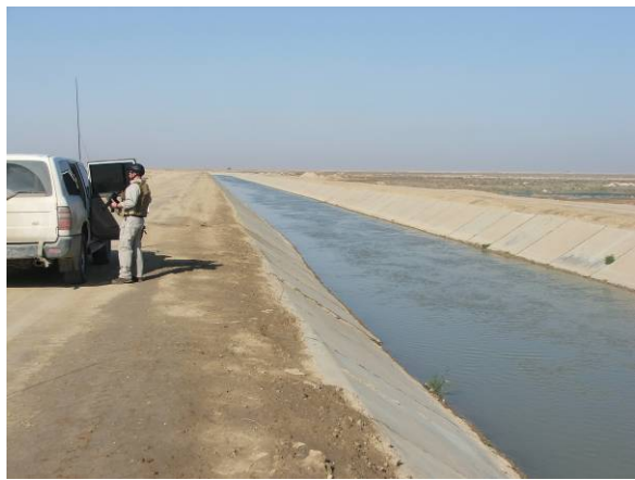
Site Photo 5. Undamaged section of canal

Site Photo 5 shows an example of the SWC with undamaged embankment and concrete liners. Site Photos 6 through 9 show examples of areas along the lined section of the canal where repairs and maintenance are required. Site Photo 10 shows an area where native rock instead of concrete panels was used for repair.