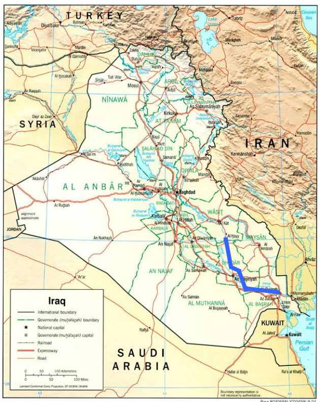
Figure 1. General location map of the Sweetwater Canal