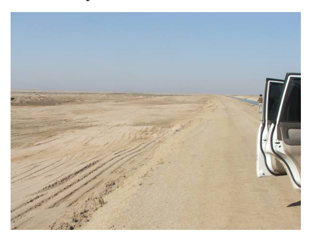
Site Photo 11. km 168 repair area

Site Photos 11 through 14 show the condition of the canal in the vicinity of the km 168 repairs and Site Photos 15 through 17 show the condition of the canal in the vicinity of the km 188 repairs.