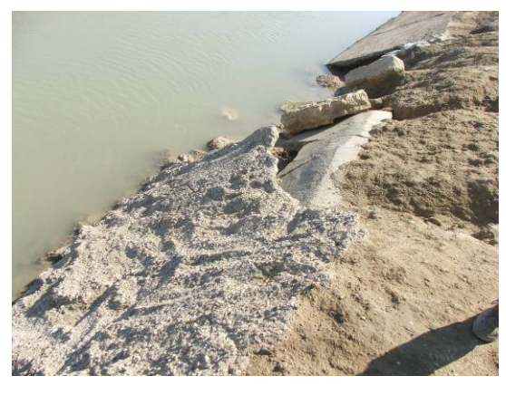
Site Photo 14. Repair of concrete liner with concrete slurry at km 168 repair area