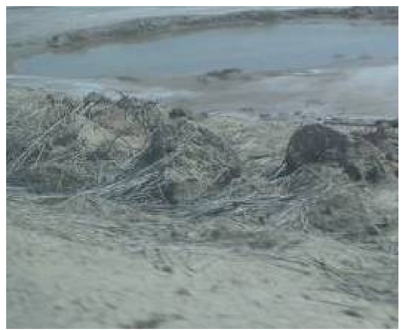
Site Photo 20. Dredge spoils located parallel to unlined section of SWC