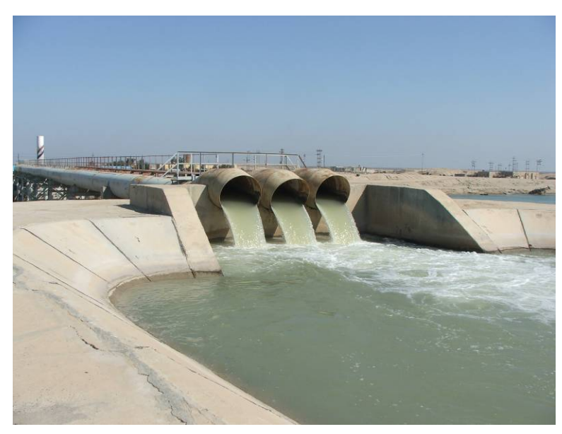
Site Photo 4. Water flowing out of all three pipelines from Pump Station #2 into the Sweetwater Canal