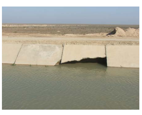
Site Photo 12. Example of under-cutting of canal sidewall in vicinity of km 168