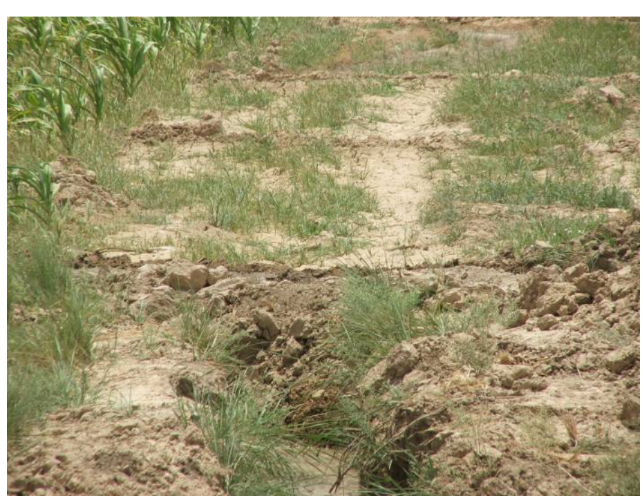
Site photo 3: Pipeline point B, leading back to point A

Point B: Point B on the locator map in Figure 1 on page 4 is the point at which the pipeline route crosses underneath an irrigation canal. A recently excavated tunnel approximately 1 meter by 1/2 meter was observed underneath the irrigation canal. The pipeline was not visible leading into (Site photo 4) or exiting the