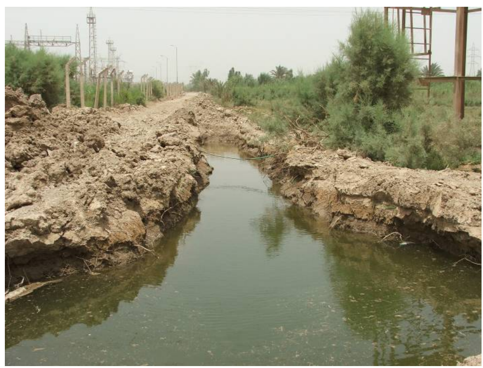
Site photo 2: Pipeline point A, leading to point B