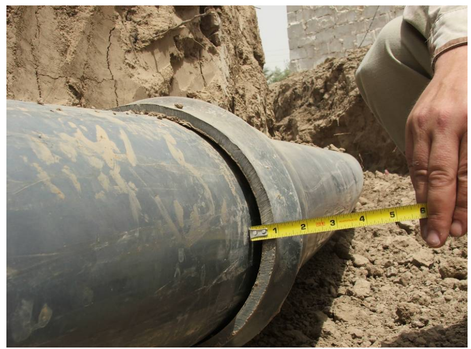
Site photo 9: ½ inch (13 millimeter) gap in pipeline joint

Point H to I: The pipeline leg from point H to point I (see the locator map in Figure 1 on page 4) is approximately 2,571 meters in length. A recently dug open trench approximately 1 meter in depth was observed along the proposed pipeline route. Pipe was not visible and the bottom of the trench excavation appeared to be undisturbed soil. Consequently, no evidence that the pipeline had been installed between points H and I was found.