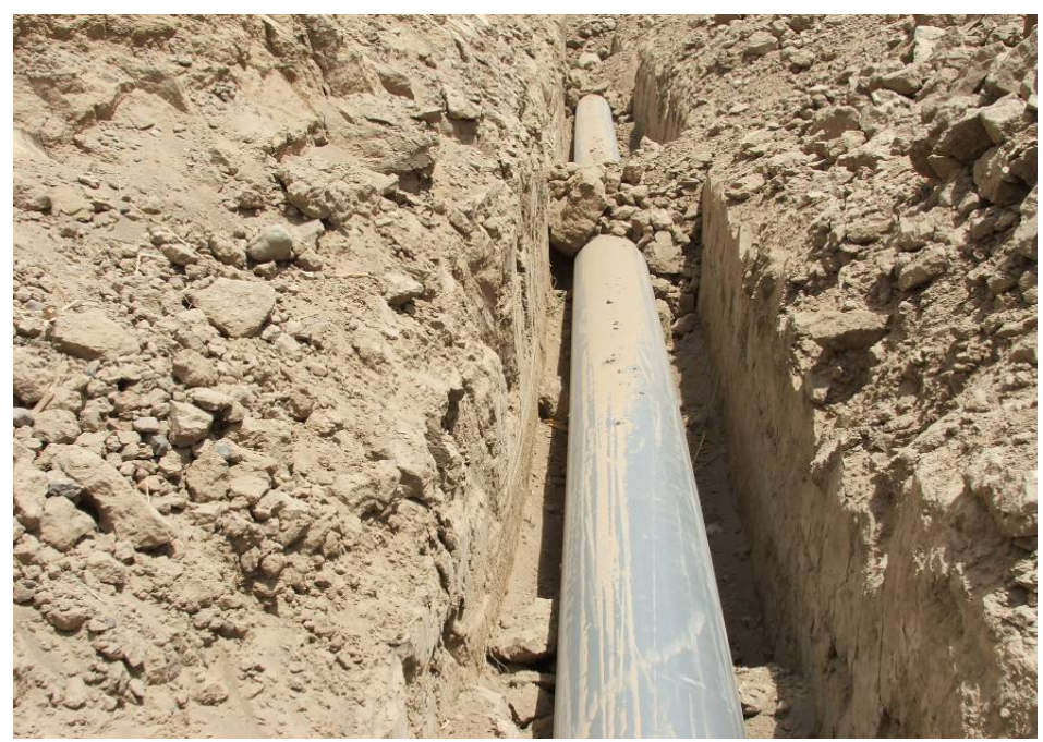
Site photo 7: 225 millimeter pipeline in partially back filled trench

The pipeline near point G was observed to be routed around a bend without the use of an elbow fitting (Site photo 8), creating a 13 millimeter (½ inch) gap in the pipe connection (Site photo 9). It appeared, based on site assessment observations, that the pipeline had been installed between point F and point G, but the pipeline installation was not consistent with contract requirements.