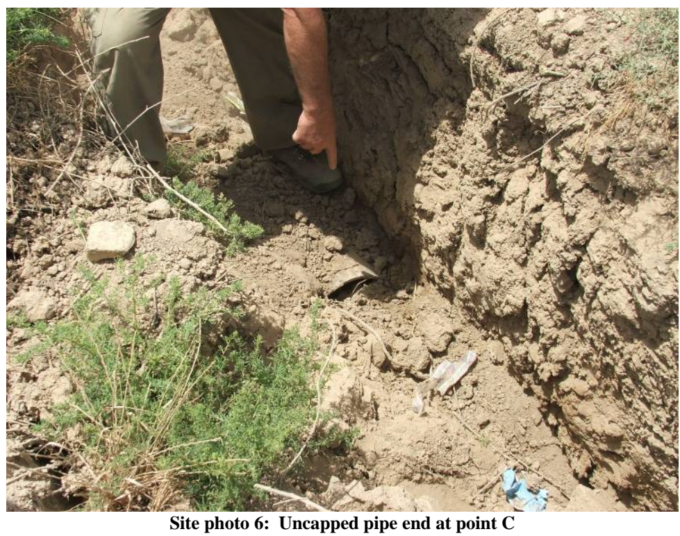
Point C to D : The approximate length of the pipeline from point C to point D (see the locator map in Figure 1 on page 4) is 110 meters. The pipeline route crosses a road intersection at this location. A recently excavated tunnel approximately 1 meter by ½ meter was observed beneath the road intersection.