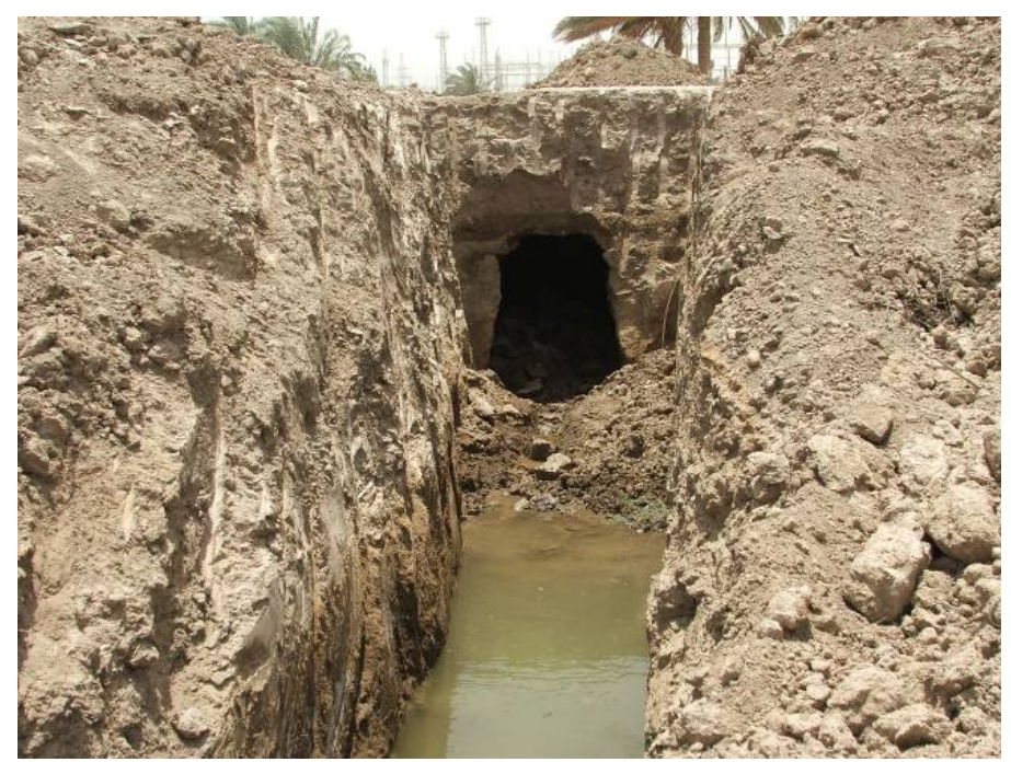
Site photo 4: Point B excavated tunnel under irrigation canal

tunnel. The bottom of the tunnel excavation appeared to be undisturbed soil. Consequently, no evidence that the pipeline had been installed beneath the irrigation canal was found.