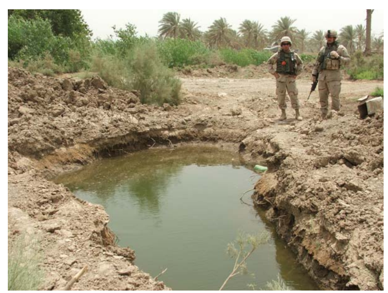
Site Photo 1: Pipeline point A, showing recent excavation

Supply and install 6,000 LM of 250 millimeter diameter UPVC pipe, 1,660 LM of 225 millimeter diameter UPVC pipe, and 670 LM of 160 millimeter diameter UPVC pipe and fittings