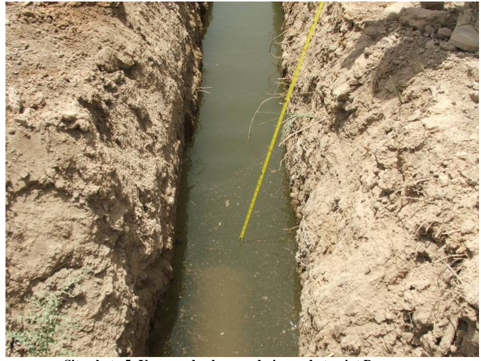
Site photo 5: Uncapped submerged pipe end at point B