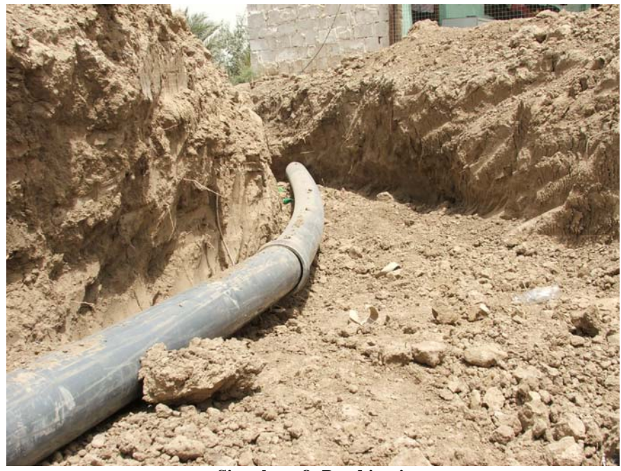
Site photo 8: Bend in pipe