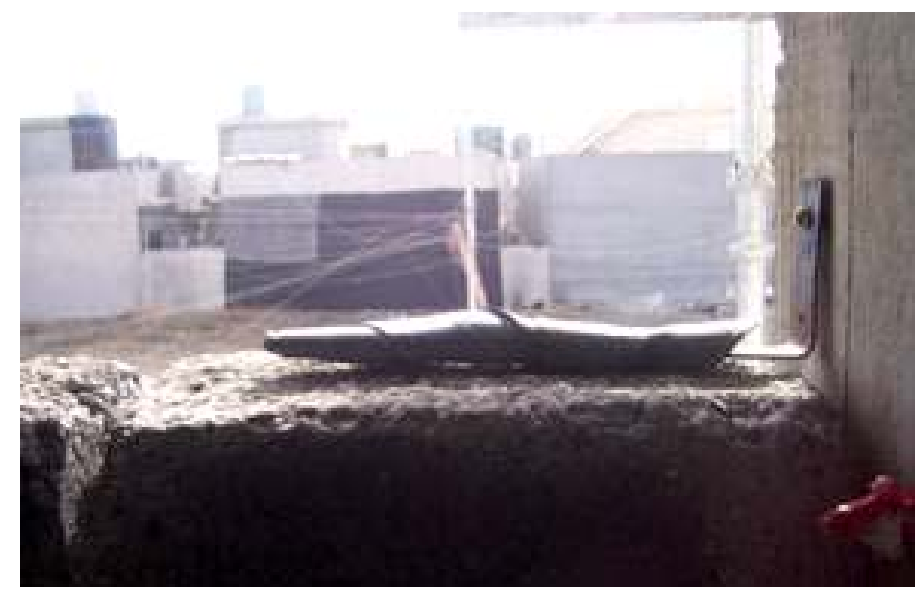
Site Photo 15. Concrete block wall tie-in connection to structural frame.

We reviewed prior site reports to determine if the contractor documented examples of the tie-in connections. Site Photo 15 taken from the contractor's 25 November 2005 site report shows the tie-in for the concrete block walls to the supporting wall. Our observations of the concrete wall work underway at the time of our assessment indicated the contractor is complying with the design standard.