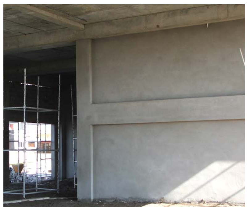
Site Photo 14. Finish coating applied to concrete surfaces on Level 1

The design for the external walls required the walls to be tied back to the structural reinforced concrete frame using stainless steel sleeved angled wall ties. For interior block walls, the design specified hot galvanized stainless steel sleeved angled wall ties for anchoring to the structural frame.