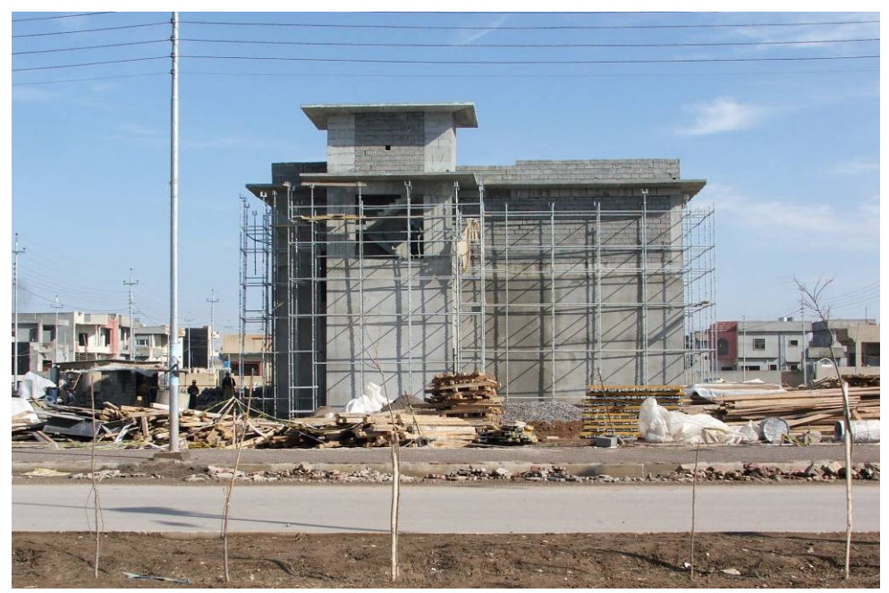
Site Photo 1: Side elevation of fire station showing lot and adjacent lane use