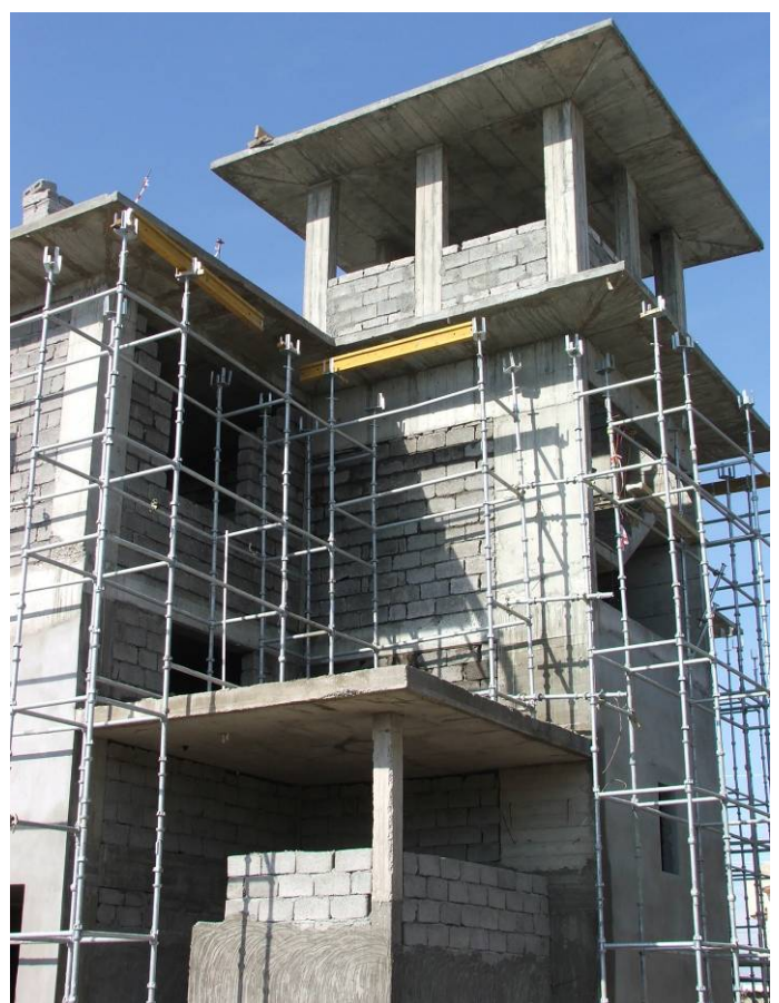
Site Photo 11. Exterior view of staircase #1

We inspected the staircases from level 1 to the roof level and determined the rise and run of the steps were adequate and consistent with the design.