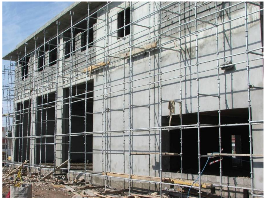
Site Photo 13. External concrete block wall construction on Level 3

The design required concrete block walls consisting of 200 mm thick external walls and internal walls of varying widths (100 mm, 150 mm, and 200 mm). Additionally, the task order specifications required a gypsum plaster coating for all interior walls and exposed concrete surfaces inside the fire station, and a cement sand mix for rendering the external surfaces. Site Photo 13 shows the external wall construction at the time of our assessment. Site Photo 14 shows the required surface coating over the walls and columns in level 1.