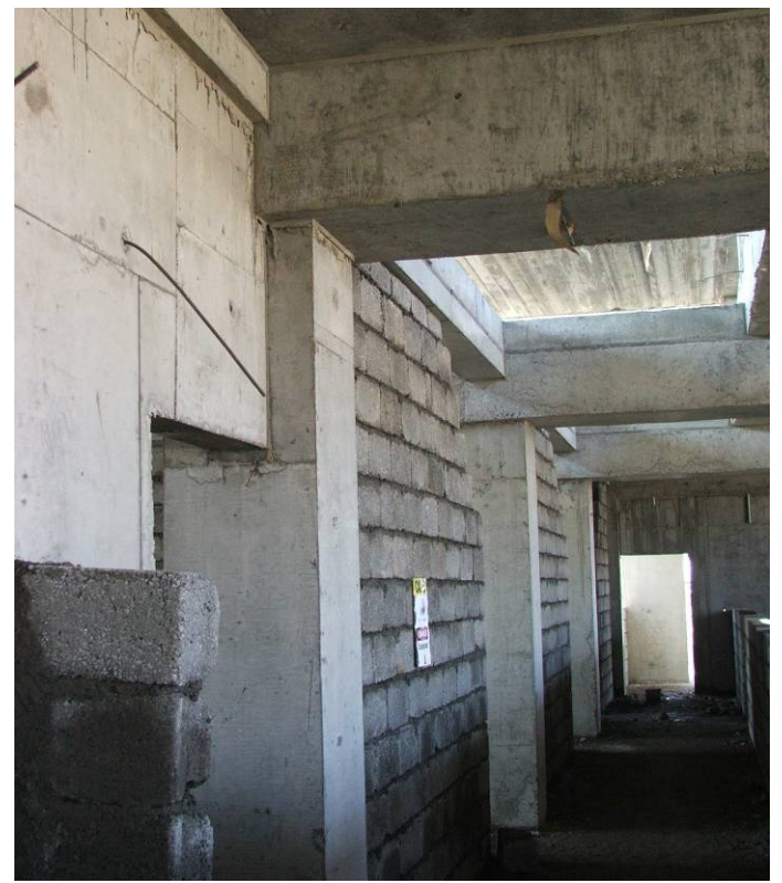
Site Photo 3: Interior structure showing concrete block walls, columns, and beams

Since the majority of prior and current construction activities were structural tasks, our assessment focused primarily on whether the construction of these elements on Levels 1-4 met the requirements of the task order design and specifications. Thus, we targeted the assessment towards the structural integrity of the fires station's columns, beams, ceiling/floor slabs, and shear walls. Prior to inspecting the site, we