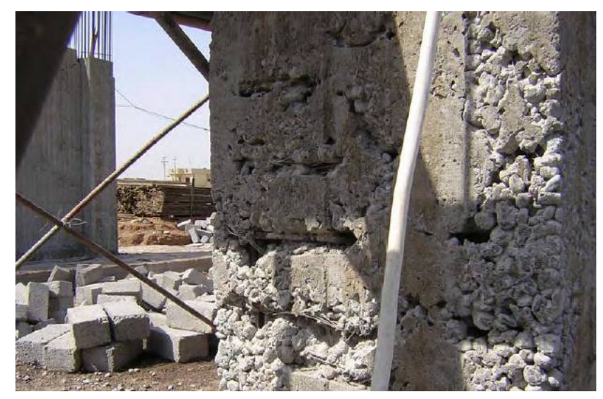
Site Photo 4. Honeycombing/exposed reinforcing steel in concrete column on Level 1 -Photo provided by USACE.

The USACE RE informed us there is a serious issue with the quality and possible structural integrity of the reinforced concrete shear walls, columns and beams located in Level 1. Parsons constructed these structural members in Level 1 in early May 2005. There were considerable voids in the reinforced concrete on this level, particularly in the columns. The first three meters of the columns contain significant honeycombing<sup>3</sup> resulting from improper placement and poor vibration of the concrete. The contractor batched the concrete onsite utilizing a small drum mixer (less than 1 cubic meter (m<sup>3</sup>) in size). The mixer produced one small batch at a time without proper controls in place to assure the same mix ratio was utilized for every batch. The process used by the contractor to fill the forms with concrete was similar to a "fire brigade," where buckets of concrete were passed down a line of workers, up a ladder and poured into the form from the top. By pouring the concrete from the top of the forms, vibrators could not reach the bottom. As a result, the concrete could not be uniformly distributed, especially in the lower areas of the column or wall. Site Photos 4-8 show honeycombing found in columns in Levels 1 and 2 after concrete placement.