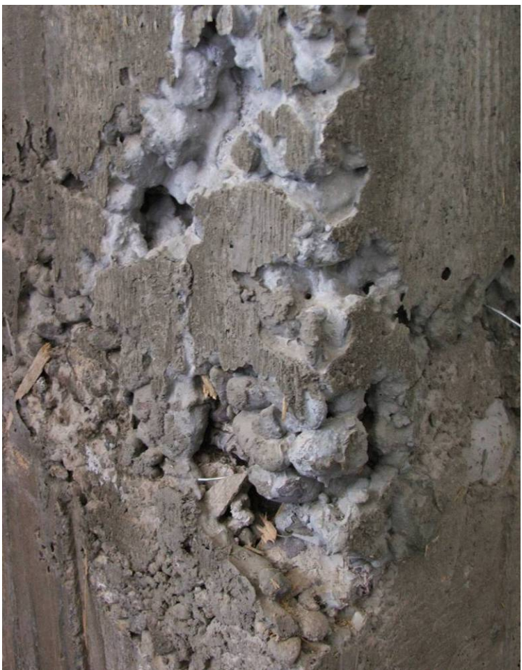
Site Photo 8. Honeycombing on Level 2 column

The proper procedure for filling the forms is detailed in section 6.9.9 of Parsons' concrete specifications. It states: