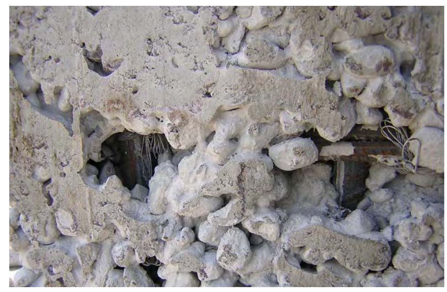
Site Photo 7. Honeycombing and exposed rebar in concrete on Level 1.

Site Photos 5 and 6 show the honeycombing on an exterior t-shaped stub wall after the gypsum plaster surface coating had been applied.