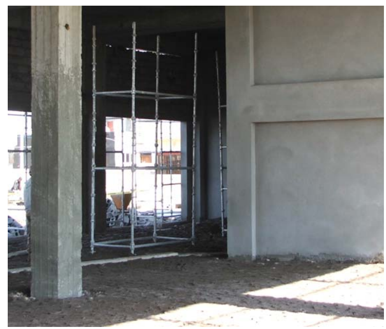
Site Photo 16. Base Preparation in Level 1 prior to floor slab construction

The design specifications for the reinforced concrete floor on Level 1 required a 200 mm thick reinforced concrete slab over a 150 mm thick consolidated hardcore (crushed aggregate) base. A damp proof membrane separates the hardcore and concrete. In addition, to fill in the voids within the hardcore and to create a smooth surface, the design called for a thin layer of fine material over the hardcore. At the time of our site assessment, the hardcore installation was in progress in Level 1. In the fire truck and SUV parking bays, the contractor had placed the hardcore and covered it with a layer of fine material. In the other areas, the hardcore was in place, but had not yet been covered with the fine material layer. Site Photo 16 provides an illustration of the fine material covering the hardcore in the fire truck parking bays. The work in Level 1 appeared to meet the contract requirements.