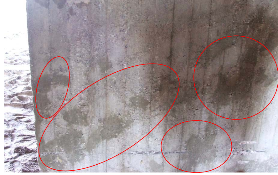
Site Photo 9. Rich cement-sand patches made on a Level 1 shear wall

the USACE Administrative Contracting Officer (ACO), Parsons' quality control engineer instructed the subcontractor to repair the concrete defects using an epoxy grout. However, Parsons' home office quality control engineer in Baghdad directed the subcontractor to make the repairs using a rich cement and sand mortar mix. Subsequently, the contractor patched the honeycomb areas utilizing the rich cement and sand mix as illustrated in Site Photo 9. The USACE RE was not satisfied with this method of repair, favoring instead the use of an epoxy grout to fill the voids in the concrete.