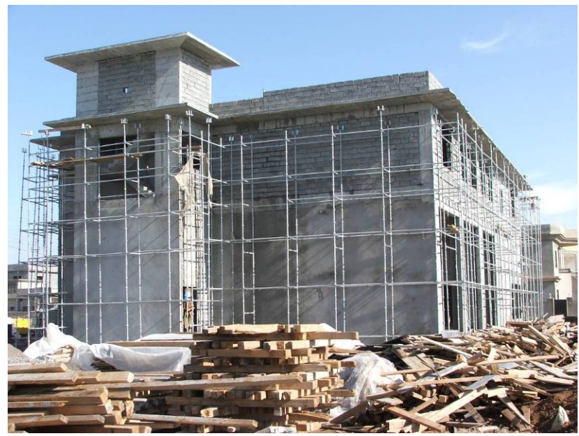
Site Photo 2. Exterior view of the Ainkawa fire station