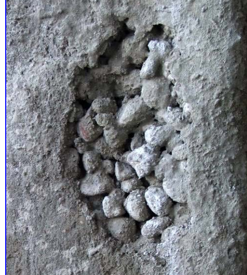
Site Photo 6. Closeup of Site Photo 5

Site Photos 5 and 6 show the honeycombing on an exterior t-shaped stub wall after the gypsum plaster surface coating had been applied.