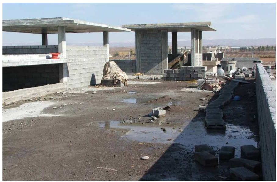
Site Photo 12. Fire station roof construction