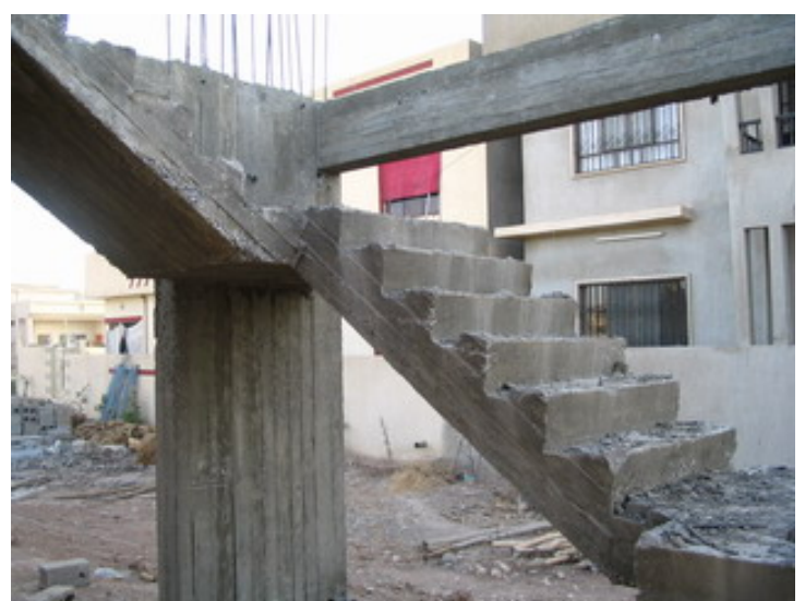
Site Photo 10. Staircase construction and supporting shear wall.

The design required two reinforced concrete staircases on each side of the fire station, serving levels 1-4. Reinforced concrete walls support the staircases, which are connected at each staircase landing. At the time of our assessment, the structural elements of the staircases were completed, but finish work had not started. Site Photo 10 shows the staircase connections to the shear walls.