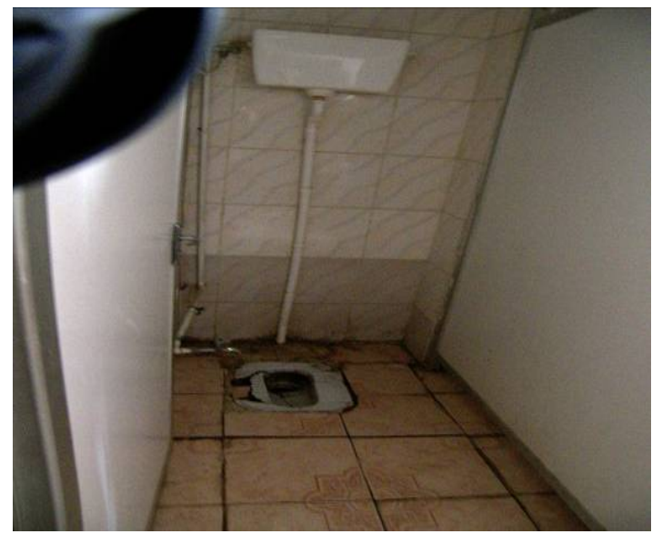
Site Photo 7. Broken eastern toilet

Although we noted minor damage to doors and some broken or missing door handles, the bedrooms, utility rooms, staircases, and hallways in the billeting areas were in reasonably adequate condition. Electrical wiring, panels, and lighting were intact and not tampered with. We could not test the electricity because the power was off. However, the billeting manager confirmed that the lights and electrical outlets were working.