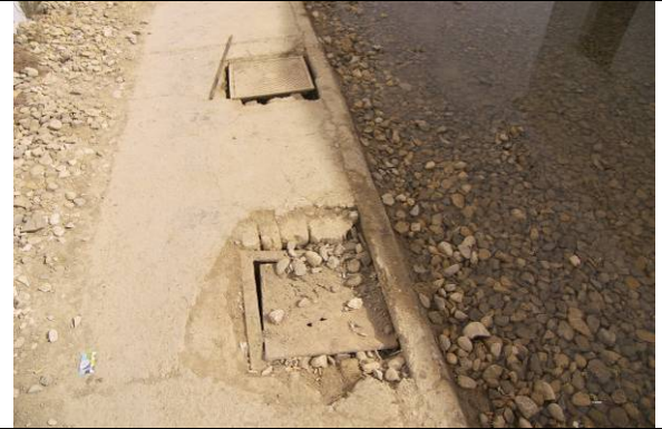
Site Photo 10. Drainage cleanout holes and standing water that should drain into the system