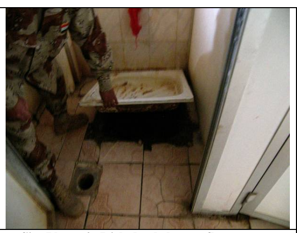
Site Photo 4. Dislodged shower floor pan at inspection