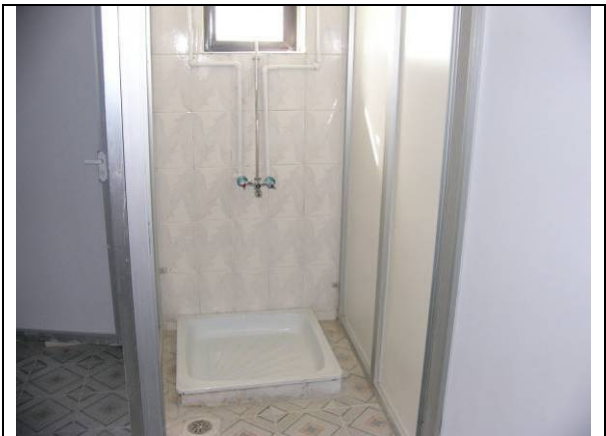
Site Photo 3. Example of a finished shower immediately after construction (From Weston photo log)