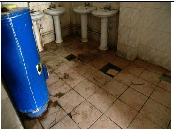
Site Photo 2. Bathroom floor and sinks at inspection