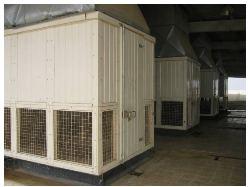
Site Photo 8. Remaining base plant generators.

twelve hours per day beginning in late afternoon. Site Photo 8 shows the condition of the generators at the time of our inspection.