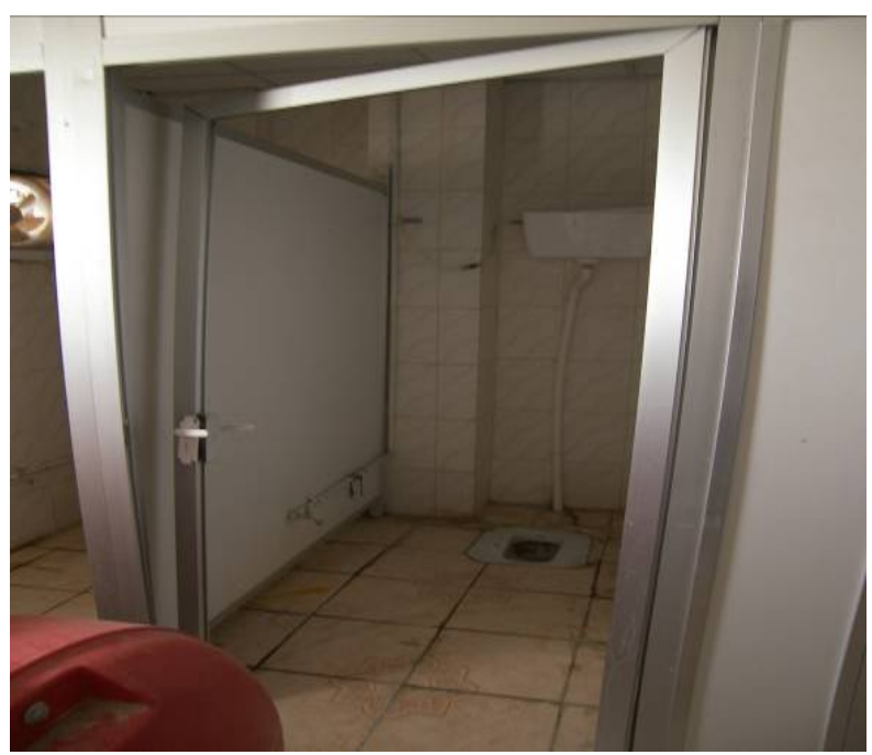
Site Photo 6. Closed toilet door frame with missing center panel