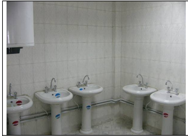
Site Photo 1. Example of bathroom sinks immediately after construction

Inadequate maintenance and apparent abuse by the occupants further compounded the problem. Un-repaired water leaks damaged floors and ground floor ceilings. Broken fixtures left sinks, showers and toilets unusable. Abusive use such as standing on western toilet seats, slamming shower doors, and stuffing water bottles down toilet drains damaged plumbing and fixtures. These abuses were also noted in an AFCEE representative's site visit report dated 2 February 2006 which cited eighteen examples of soldier abuse to the bathrooms including drains filled with debris, discarded drain covers and cracked toilets. The report commented that the abuse started when the Iraqi soldiers occupied the facility. Site Photos 1 though 7 show the damage to the facilities SIGIR inspected.