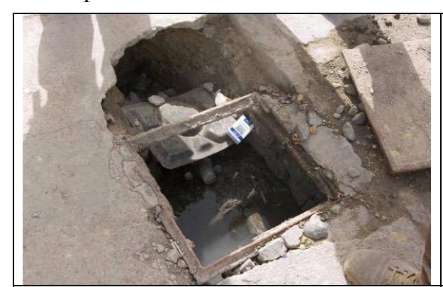
Site Photo 9. Broken drain cleanout hole

SIGIR's inspection disclosed a number of sidewalks and drain cleanout holes with un-repaired damage from inadequate workmanship and vehicle traffic. The sidewalks and cleanout holes were designed for pedestrian traffic. Quality issues existed at the time the base was delivered to the USG. An AFCEE warranty inspector visited the site on February 2 and 3, 2006 and noted that approximately 70% of the concrete work done on sidewalks was of poor quality and would need to be replaced. Warranty requests provided by AFCEE show that repairs were made to sidewalks in the 100, 200, 600, 700 and 800 complex areas from May 25, 2006 to June 3, 2006. Our inspection showed that quality and damage issues still existed at the facility. Site photos # 9 and #10 show the sidewalks and drain cleanout holes at the time of our inspection.