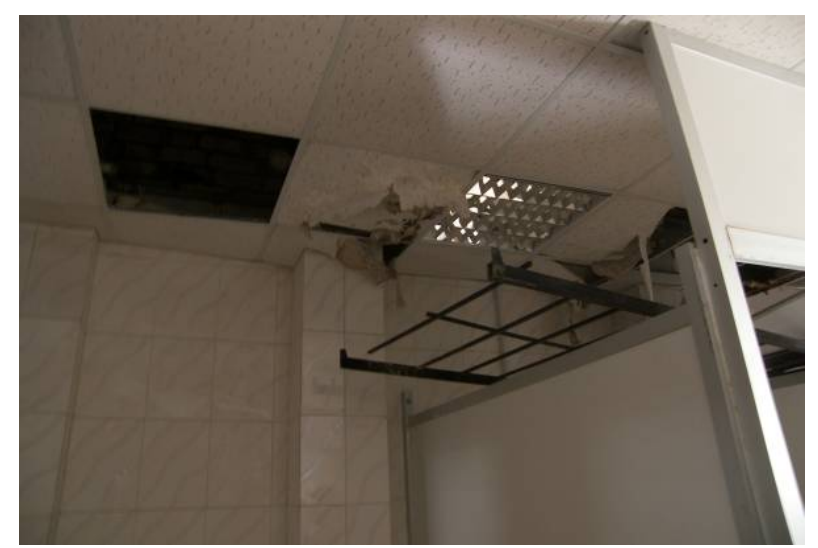
Site Photo 5. Ground floor ceiling water damage caused by leak and excess water from the bathroom above. The bed frame was apparently used to protect the person below in case the ceiling collapsed.