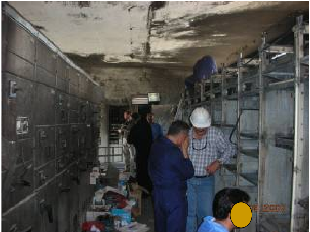
Site Photo 6. Control center cleanup and repair work in progress.

Switchyard. While operational at the time of our site visit, the switchyard should be overhauled. GRD Electricity Sector managers explained that, in the past, several insulators have been damaged from bullets and shrapnel and that most of the insulators need to be cleaned. The breaker control and protection circuits need to be tested (Site Photo 7). Resident GRD Electricity Sector managers, while working on the Unit 5 and 6 section of the switchyard, observed that several protections and controls have been bypassed and some high voltage breakers would not work remotely or were leaking SF6 insulating gas. Additionally, GRD Electricity Sector managers were not aware of any switchyard control or standard operating procedures (SOP) utilized by the MOE. Nonetheless, the MOE has total control of the switchyard and only allows contractor personnel to work on the Unit 5 and Unit 6 section(s) of the switchyard. Based on discussions with the resident GRD Electricity Sector manager, the switchyard lineup should be changed to ensure that power is distributed evenly from Units 3 through 6 to each outgoing line to avoid overloading any particular line section in the switchyard. At the time of our site visit, the resident GRD Electricity Sector manager stated that such a recommendation would be made in a timely manner before restarting Units 5 and 6.