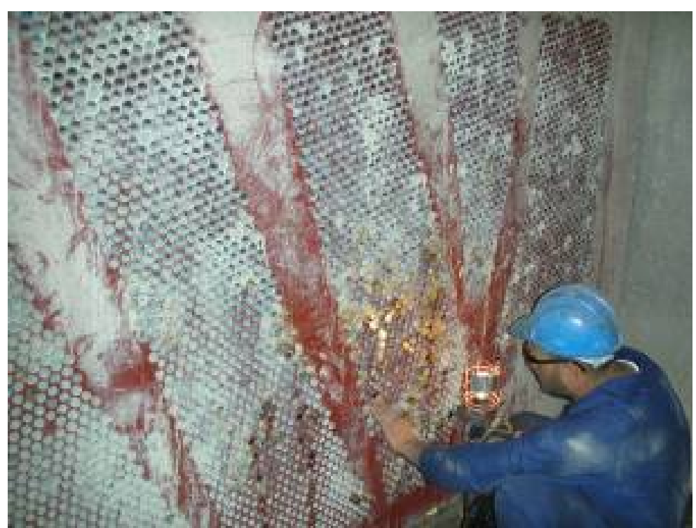
Site Photo 2. Condenser cleaning and repair.