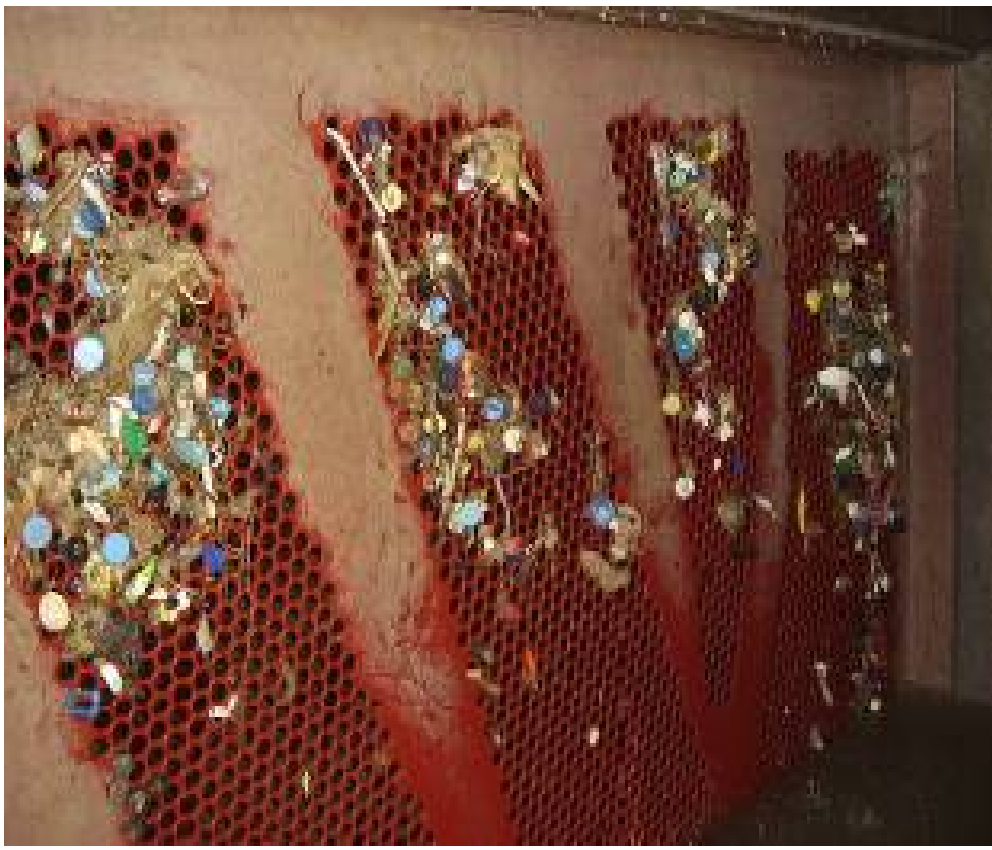
Site Photo 1. Condenser clogged with debris