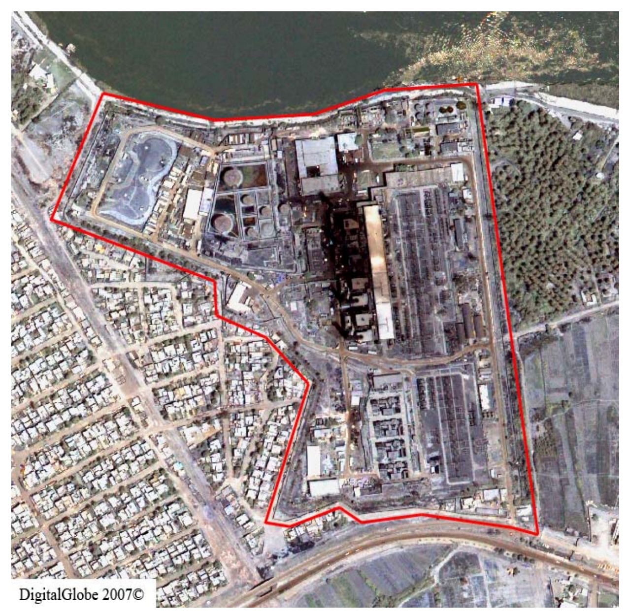
Aerial Image 1. Doura Power Plant