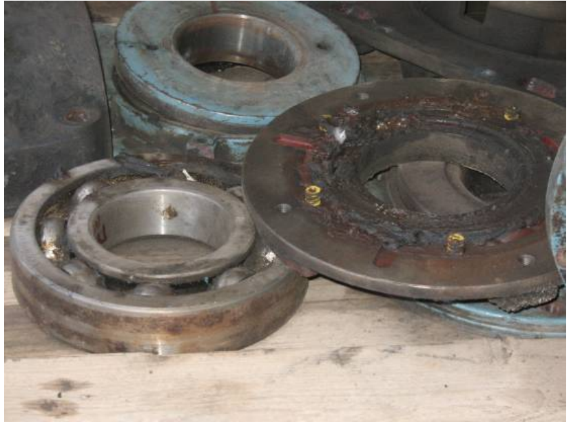
Site Photo 3. Inadequate lubrication caused bearings to fail. (10 June 2007)

In addition, ineffective general maintenance of the exciter resulted in an oil and dust accumulation in the rotor end windings and rectifier wheel areas. The film of oil, dust, and mud created short circuit paths between the end winding connectors of the exciter. When combined with other operational problems, a short circuit (flashover) occurred and the exciter was rendered inoperable when the rotor windings were damaged. SIGIR observed a large bearing that failed and damaged the shaft on a piece of component equipment because of inadequate lubrication. One of the resident Electricity Sector managers agreed that lubrication is a key component of any effective preventative maintenance program. In this case, the bearing ran nearly dry and generated so much heat that it had to be cut for mechanics to remove the bearing from the rotating shaft (Site Photos 3 and 4).