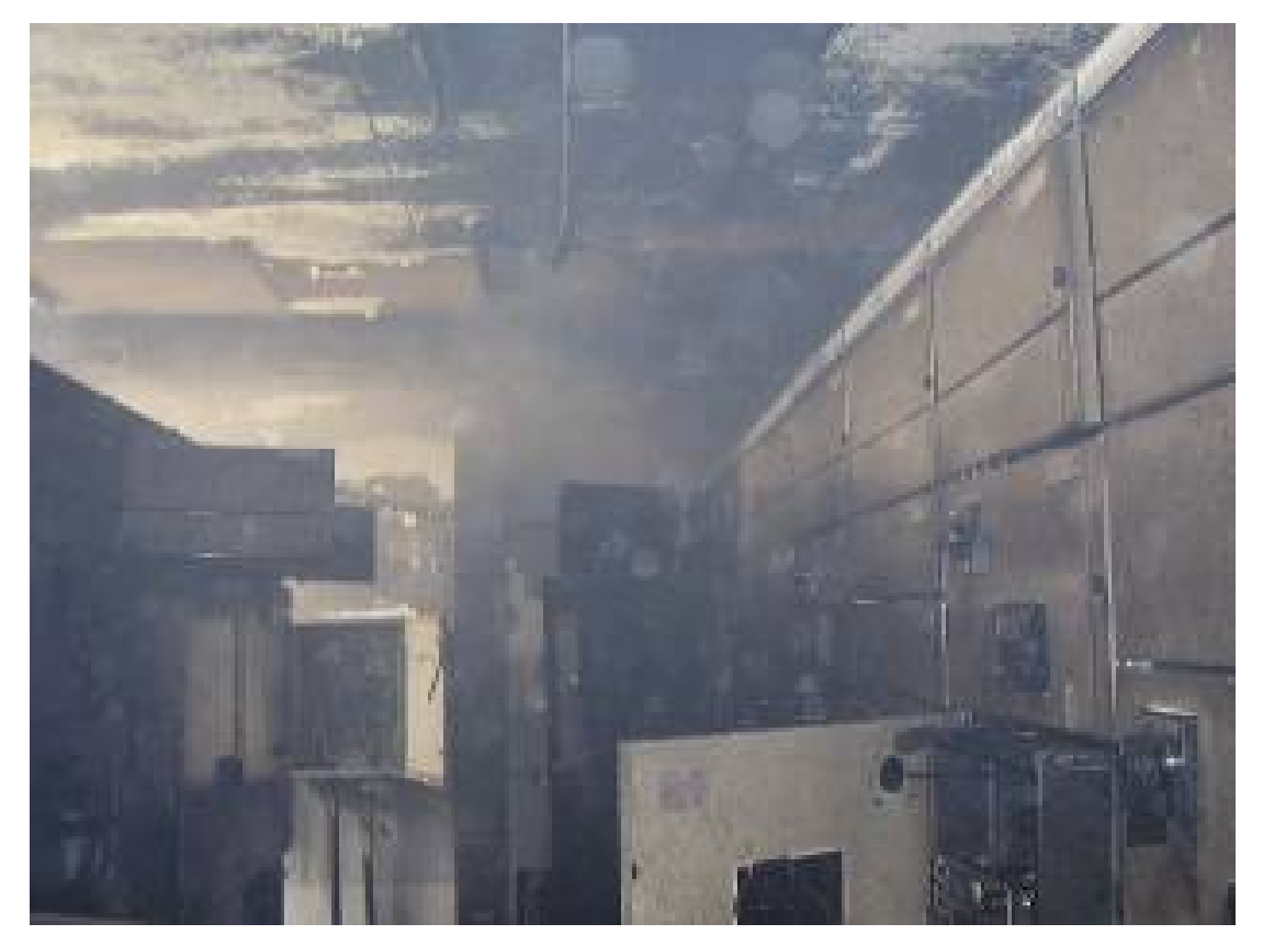
Site Photo 5. Oil Station control center after May 2007 fire.

The preferred way to provide power to the "village" would be to have operators at the Iraqi Central Control for Transmission and Substations line up the system so that the "normal" grid power would be available to the Doura village. However, normal power has not been available to the village because all the electricity has been routed to the Baghdad grid and the substation within the grid that serves the Doura village has not been operational.