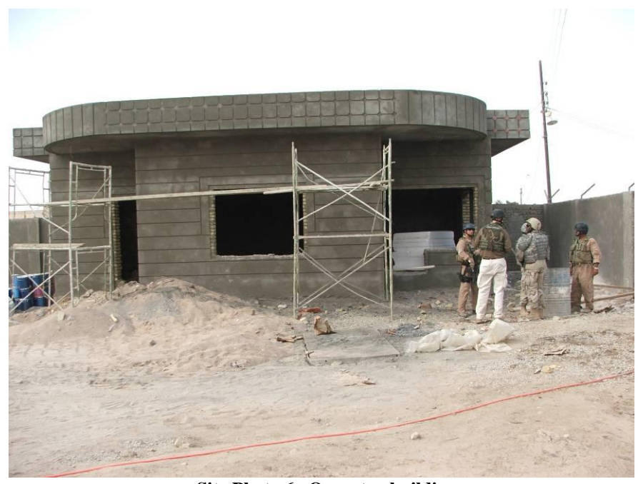
Site Photo 6. Operator building

At the time of the second site visit, the contractor had started construction of the operator building (Site Photo 6) and chemical building (Site Photo 7), including the installation of the crane (Site Photo 8).