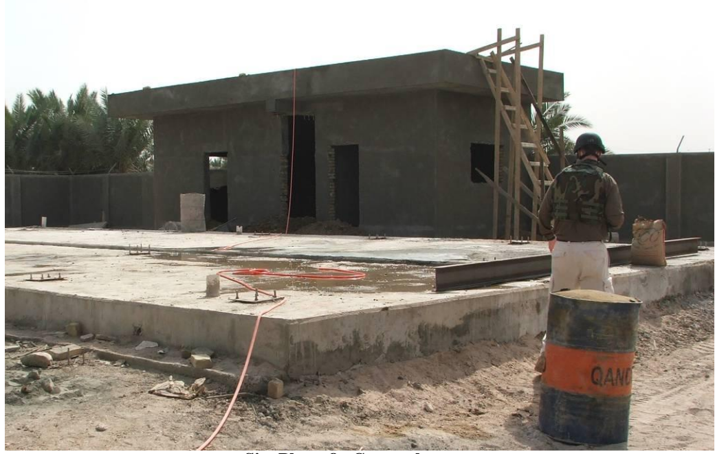
Site Photo 8. Crane placement