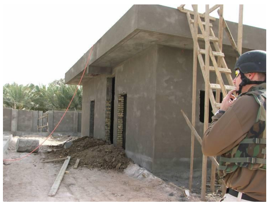
Site Photo 7. Chemical building