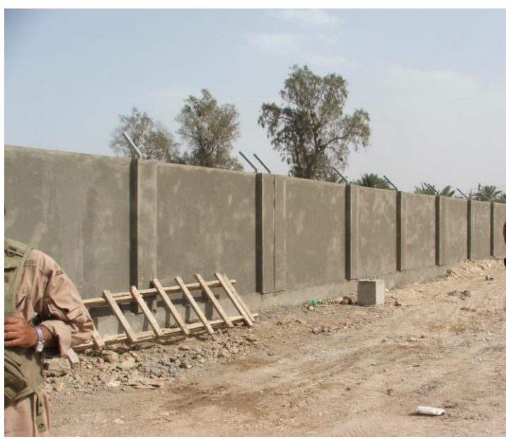
Site Photo 4. Perimeter wall

SIGIR observed significant work underway in the Al Ager WCU construction area. For example, for the security of the plant and its operators, the Statement of Work required exterior perimeter fencing, consisting of brick and topped with three strands of barbed wire. During the second site visit, SIGIR determined that the exterior site fencing was nearly completed (Site Photo 4), excluding the three strands of barbed wire (Site Photo 5).