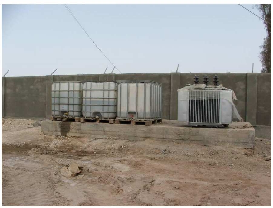
Site Photo 3. Future generator pad

No other significant work elements were completed prior to the site visit for the project.