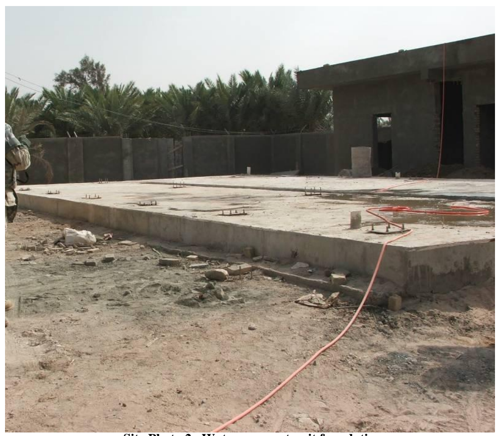
Site Photo 2. Water compact unit foundation