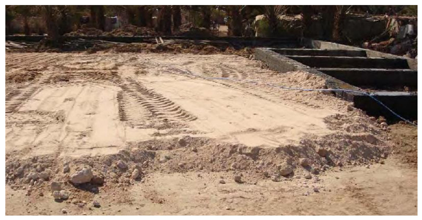
Site Photo 1. Spreading of sub base before compaction