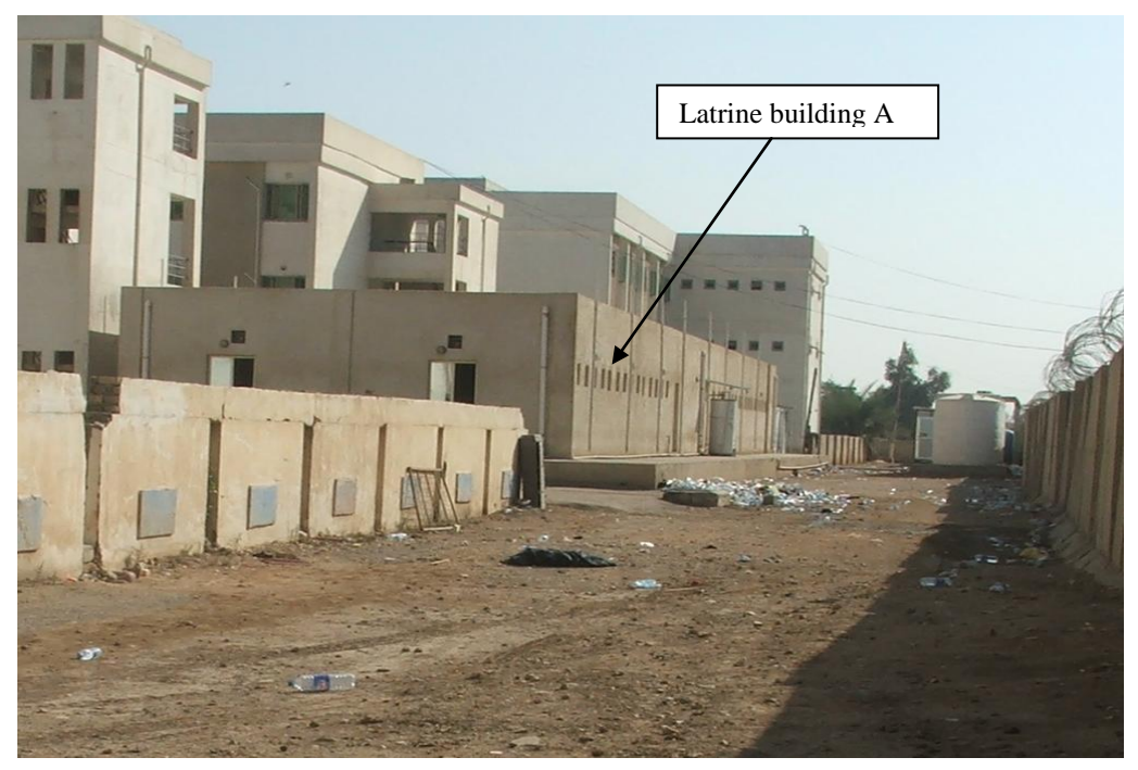
Site Photo 5. Latrine building A and its water heaters placed between cadet barracks