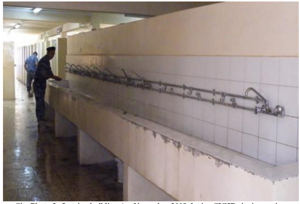
Site Photo 2. Latrine building A – November 2008 during SIGIR site inspection

The latrine trailers were new when delivered and installed. Site Photo 3 shows a latrine trailer at the time it was delivered and installed. Site photo 4 shows a latrine trailer at the time of the site inspection on 25 November 2008.