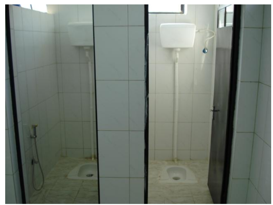
Site Photo 9. Toilet in new latrine building at turnover to GOI in May 2008