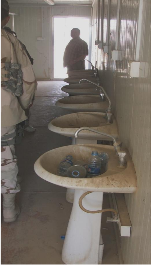
Site Photo 11. Condition of hand-and-foot washing stations in latrine trailer.

SIGIR inspectors observed the latrine trailers during the inspection on 25 November 2008 (Site Photo 11 and 12). The eight latrine trailers were particularly filthy, thereby creating a health hazard. In response to the vandalism, MNSTC-I and the GOI have taken actions to minimize future issues with respect to construction. These actions include building stand alone latrines separate form barracks to separate the plumbing and potential for water and sewage damage in living areas and transfer buildings to specific GOI agencies and organizations. Specific Iraqi ownership has improved the operations and maintenance of the facilities. Installing gravity-fed water systems where practicable to account for uncertainty in the electrical systems to ensure potable water is still available when needed.