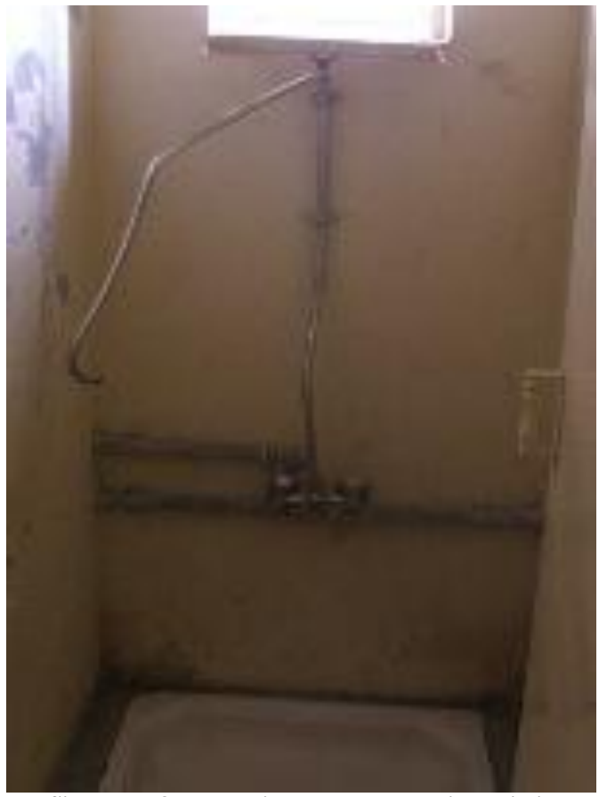
Site Photo 8. Vandalized showers - latrine building B