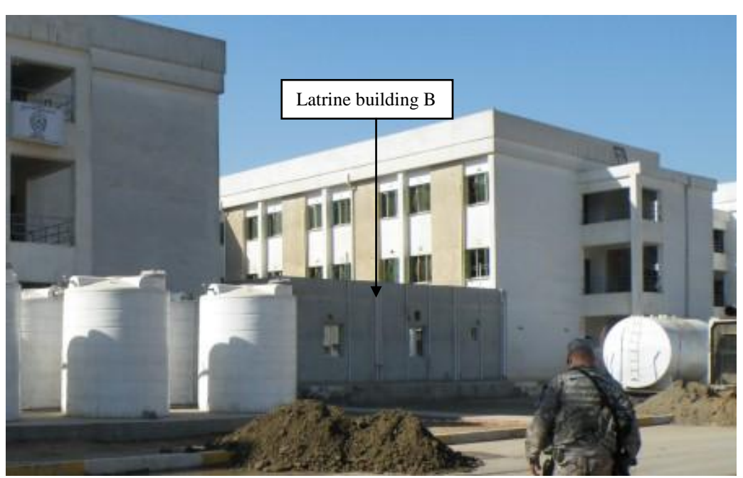
Site Photo 6. Latrine building B, between cadet barracks

In the latrine buildings, there was extensive vandalism and theft of fixtures including exhaust fans torn out of the windows (Site Photo 7), shower pipes bent beyond use (Site Photo 8), faucets removed from hand-and-foot washing stations and capped off (Site Photo 2), and toilet flush tanks torn off the walls. Site Photo 9 shows toilets at the time of turn over to the Government of Iraq (GOI) in May 2008. Site Photo 10 shows a toilet at the time of the site inspection on 25 November 2008. In a number of instances, the shower stalls in the newly built latrine buildings had shower head piping bent over in an