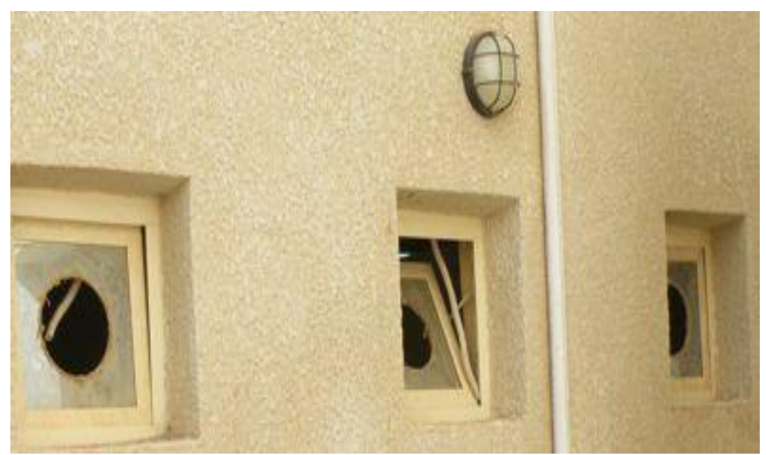
Site Photo 7. Exhaust fans were removed from new latrine buildings

unusable condition. The inside of the building had missing, or extensive damage to the plumbing fixtures.