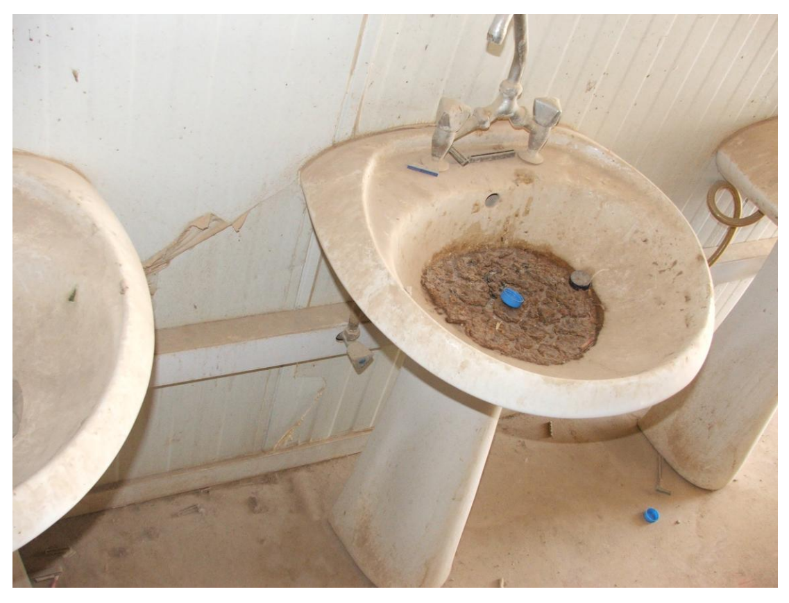
Site Photo 4. Latrine trailer at the time of the SIGIR site inspection on 25 November 2008.