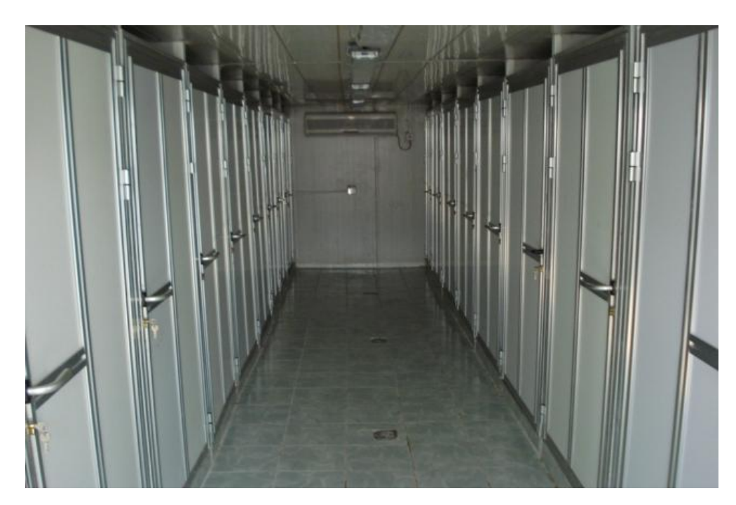
Site Photo 3. Ablution trailer at turnover to GOI

The latrine trailers were new when delivered and installed. Site Photo 3 shows a latrine trailer at the time it was delivered and installed. Site photo 4 shows a latrine trailer at the time of the site inspection on 25 November 2008.