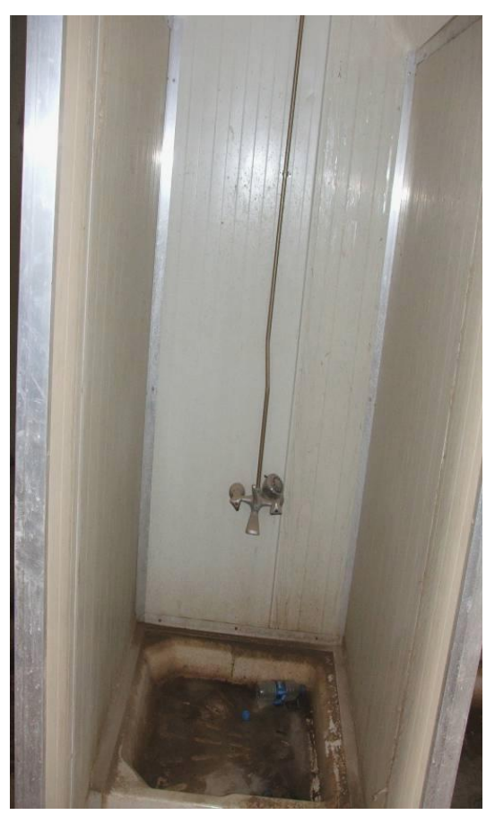
Site Photo 12. Condition of shower in latrine trailer.