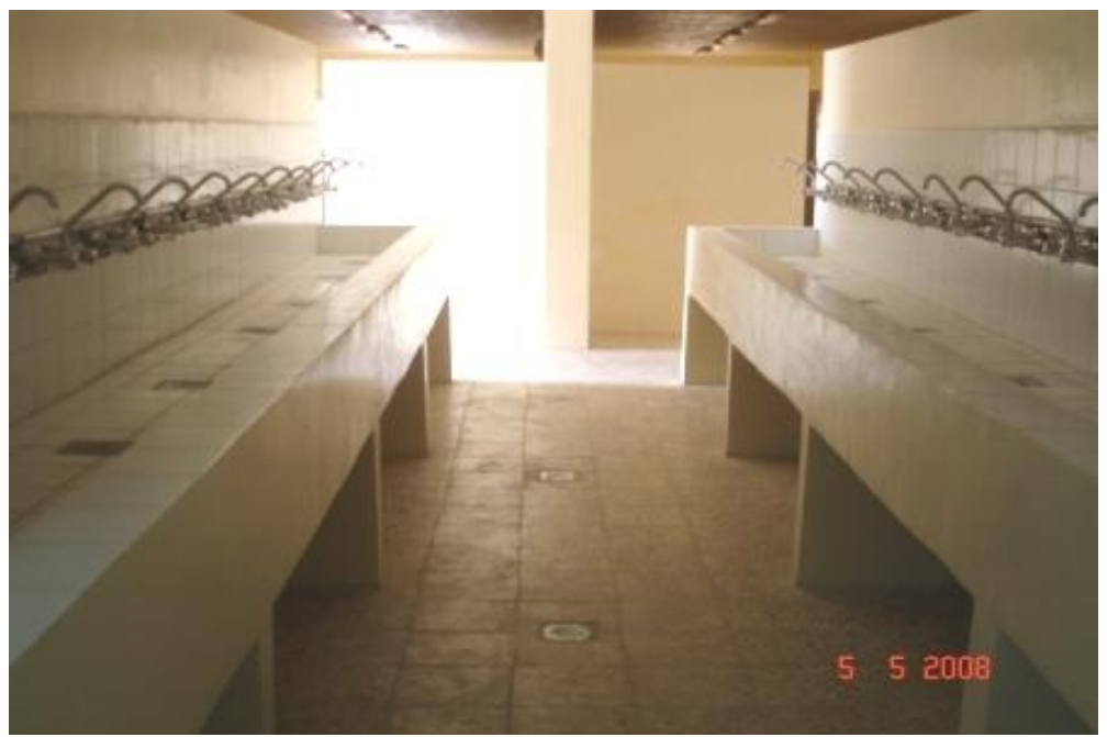
Site Photo 1. Latrine building A - May 2008 at turnover to GOI

The contract warranty clause provides that, "The Contractor shall also provide one-month of classroom and on the job training for all onsite equipment, and warranty and operations and maintenance oversight for a period of twelve months." However, the extensive vandalism damage and the widespread apparent theft of plumbing, heating, and ventilation equipment has rendered warranty provisions for the two new latrine buildings unenforceable (Site Photo 2).