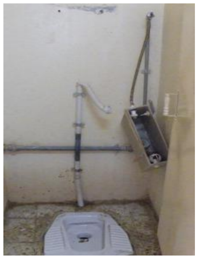
Site Photo 10. Toilet in the new latrine building during the SIGIR site inspection (11-25-08)