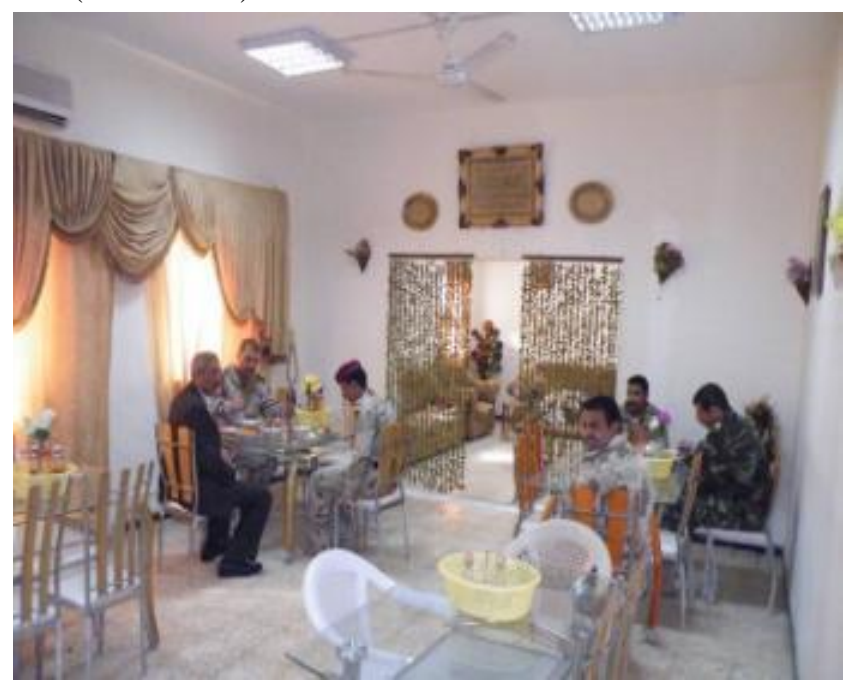
Site Photo 5. Commander's dining area

Because the contract did not provide for furnishings, GRS personnel were not sure if the furnishings were transferred from another facility or purchased by the Government of Iraq. The commander's office and the dining area furnishings appeared functional, but not very durable (Site Photo 5).