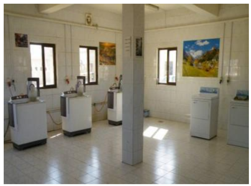
Site Photo 13. Laundry facility interior