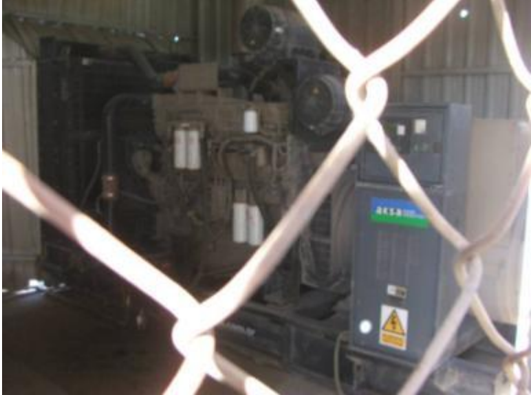
Site Photo 8. Electrical control panels