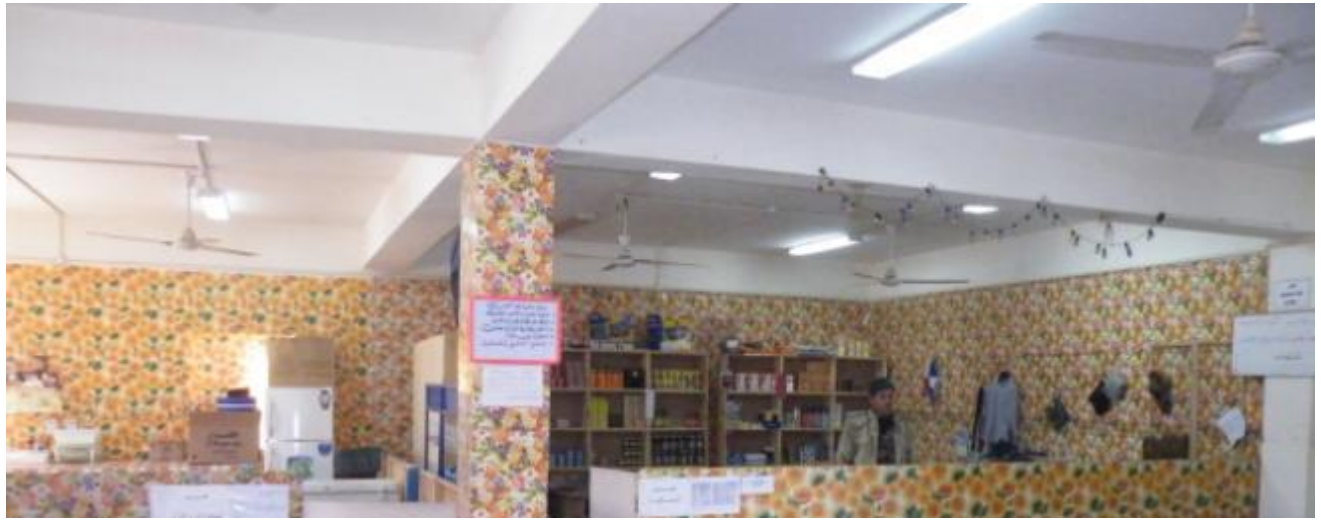
Site Photo 11. Room converted into convenience store