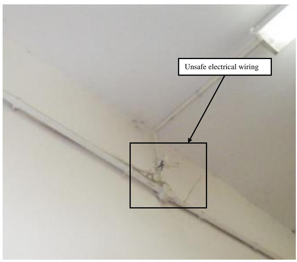
Site Photo 3. Unsafe electrical wiring