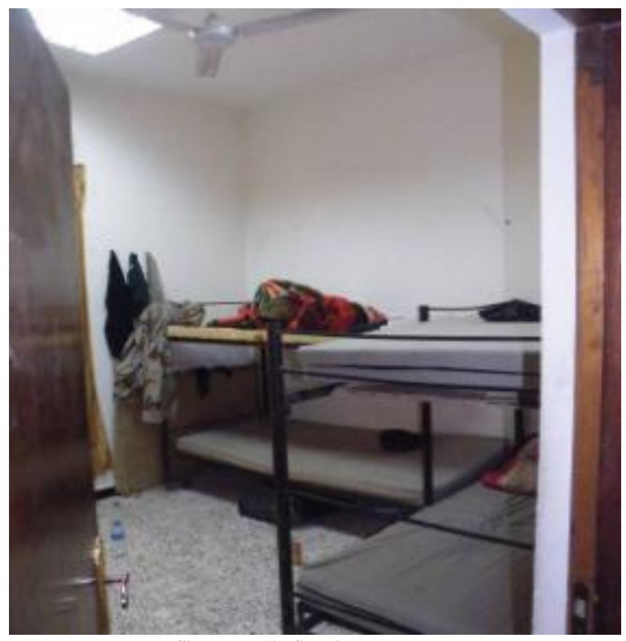
Site Photo 10. Sleeping room