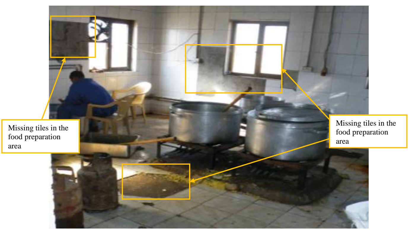
Site Photo 12. Food preparation and cooking area

A separate building was used for preparing and cooking the food. This building was similar in construction, but was not well maintained. For example, wall and floor tiles were missing or damaged, and food, dirt, and debris covered the floor and walls (Site Photo 12). Although the food preparation area was designed for electrical food preparation and heating equipment, no electrical equipment was present. Instead, meals were cooked using portable gas cylinders with open-flame grates. The building appeared adequately constructed.