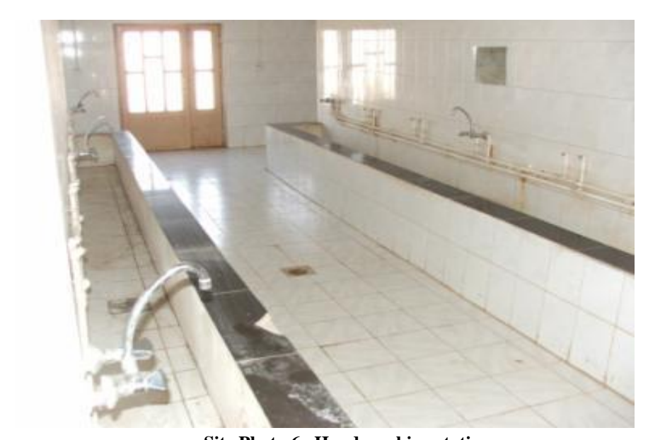
Site Photo 6. Hand-washing station

The SOW stated that the contractor was to construct four 12 x 12.4 m latrine buildings. The facilities would contain 20 water closets, 20 showers, and 28 faucets for hand washing. Site Photo 6 shows the hand-washing area. The restrooms were functional; however, SIGIR observed cracks in the tile, missing and broken faucets, and a lack of housekeeping evident by the level of cleanliness observed.