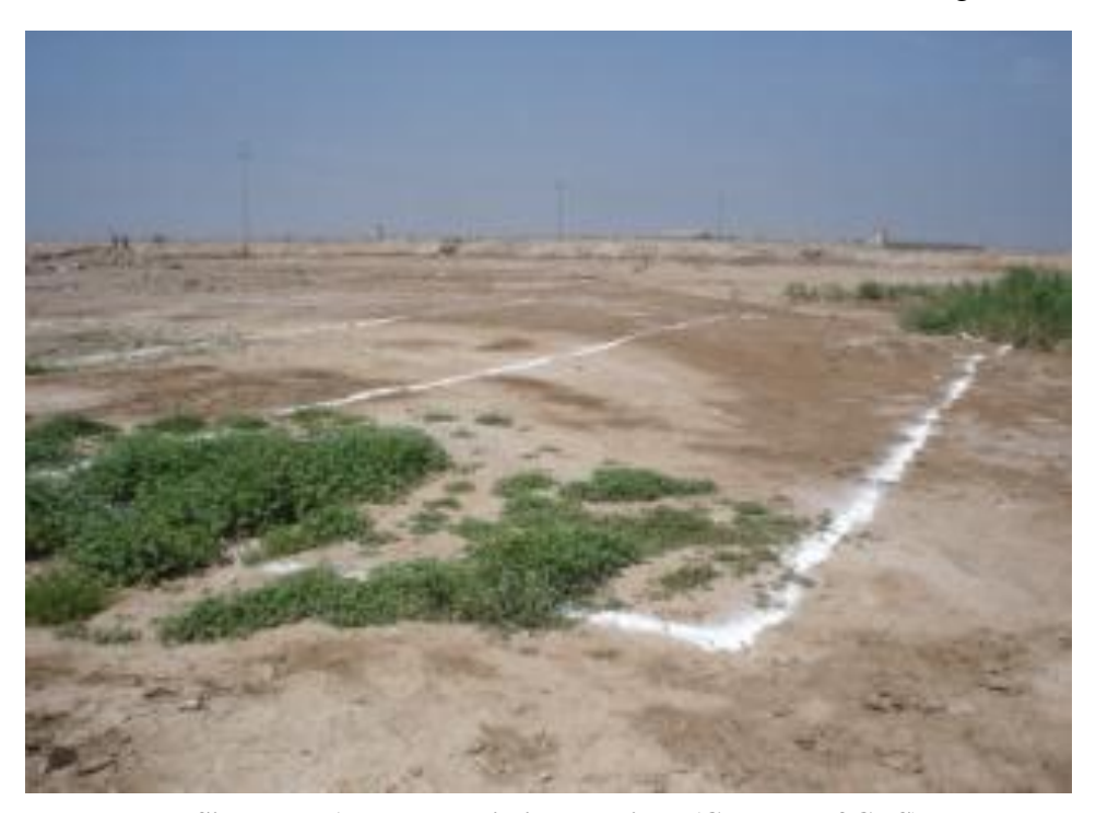
Site Photo 1. Future building location

Before the contractor began new construction at the 4<sup>th</sup> Brigade 10<sup>th</sup> Infantry Division project, the contractor cleared the area and outlined the future locations of the buildings (Site Photo 1). Site Photo 2 shows the construction of two latrine buildings.