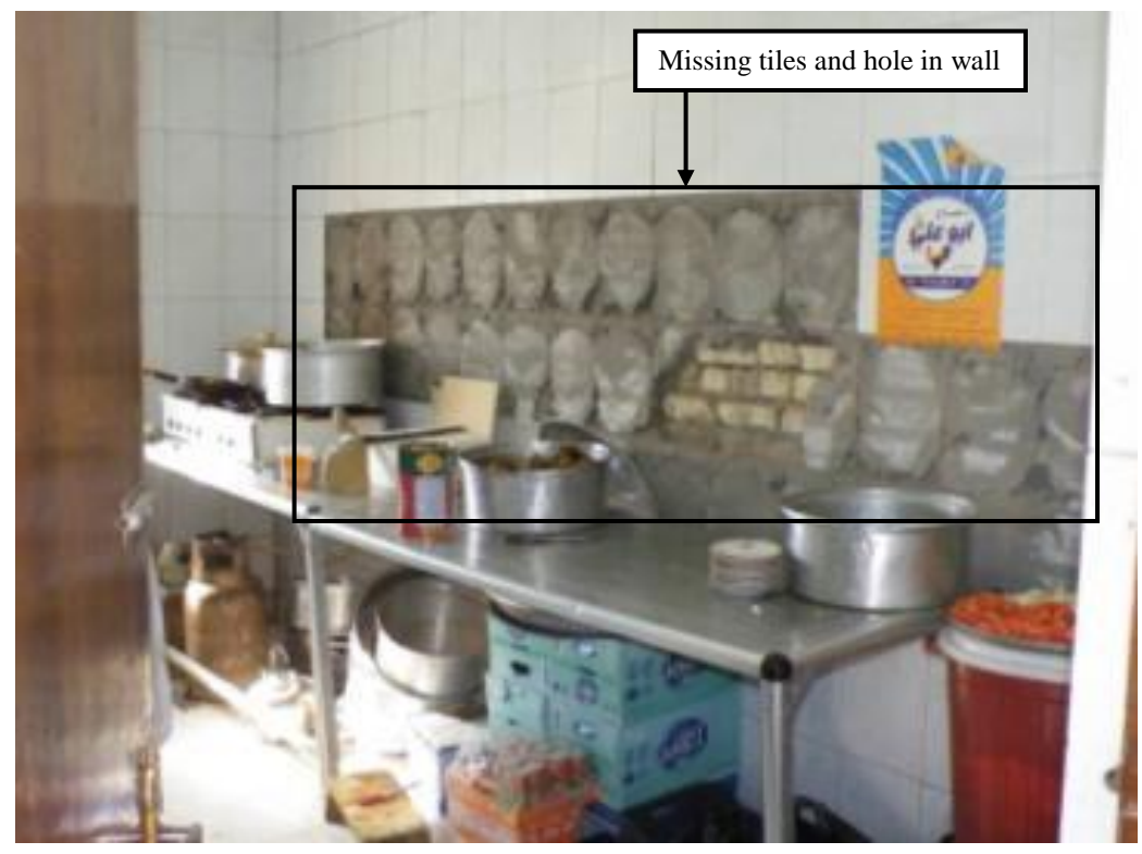
Site Photo 4. Damaged kitchen wall and tiles