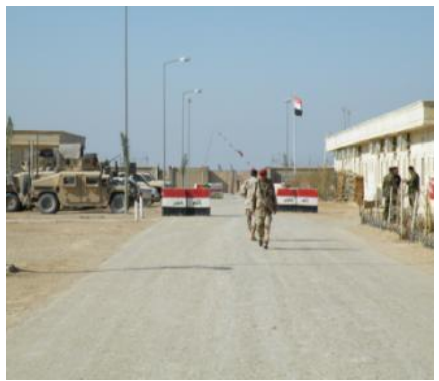
Site Photo 7. Paved road

The contractor was required to construct a 7 m-wide aggregate roadway to connect the new construction with the existing roads. SIGIR observed that the project had paved roadways between the buildings connecting to the main entrance (Site Photo 7). Also, the security lights were to be mounted on 4 m-high poles. During the site visit, SIGIR observed mounted security lights around the perimeter wall.