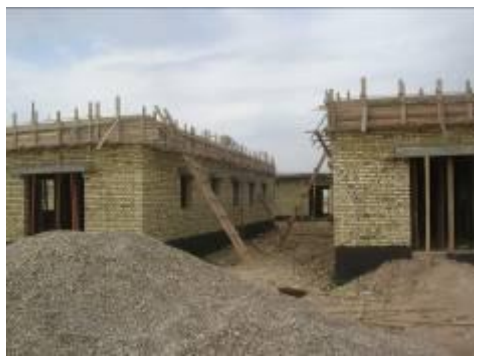
Site Photo 2. Latrine buildings