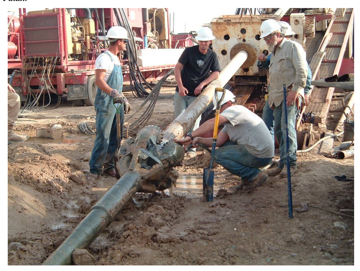
Site Picture 3: HDD Rig with Backreamer

be maintained, backreaming becomes improbable. Site pictures 3, 4, and 5, taken from a progress report prepared by Laney, show the drilling rig and cobble encountered at Al Fatah.