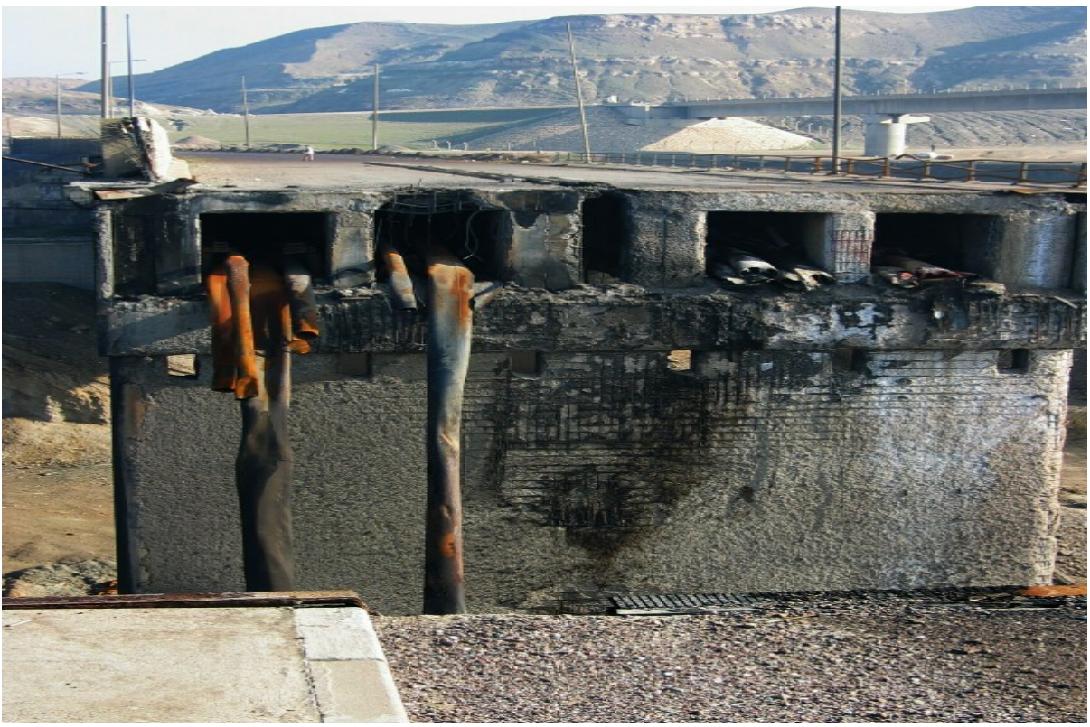
Site Photo 2: Bridge cross section showing the melted pipes from the bomb damage