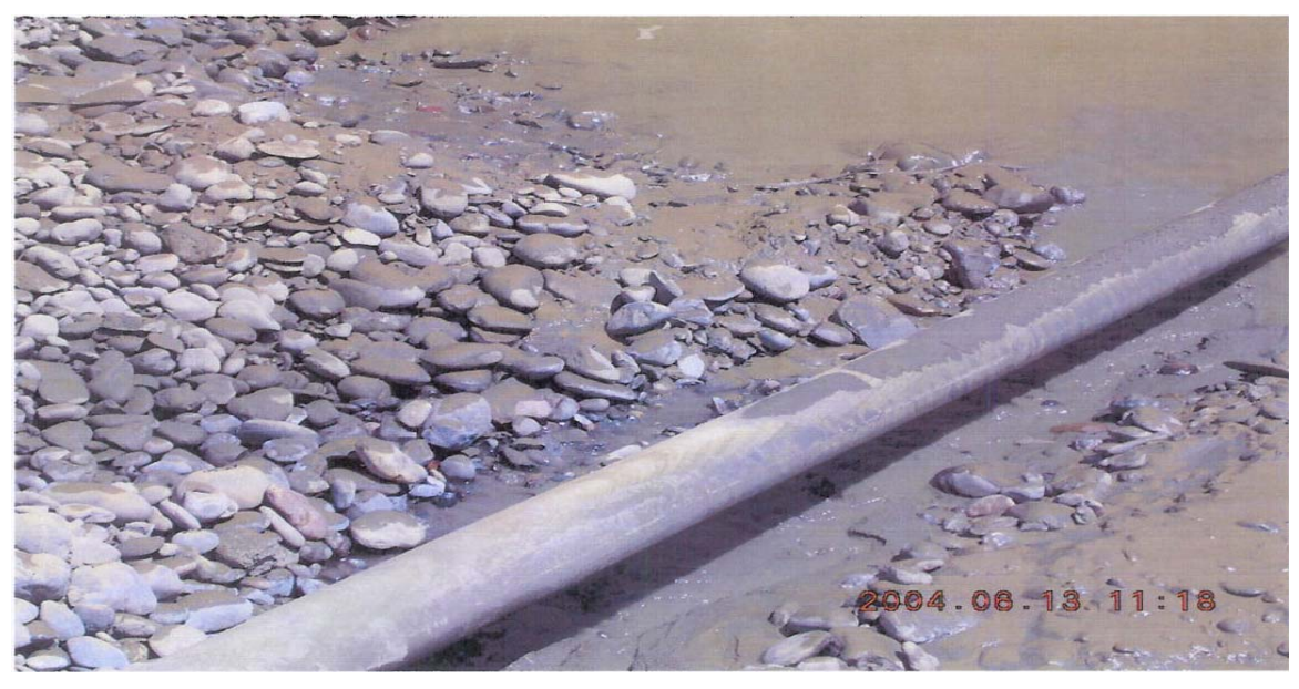
Site Picture 4: Example of cobble at the drilling location