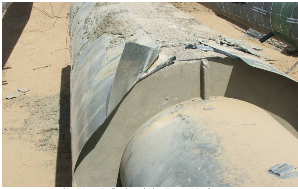
Site Photo 7: Section of Pipe Encased In Concrete

The river site survey and investigation identified the crossing location, and where the nine pipelines were strung and welded on the east side of the Tigris. All nine pipelines placed in the river crossing trench were encased with concrete to increase their density so they remain submerged in the trench. Site photo 7 shows the encasing for one of the pipes that was laid in the trench.