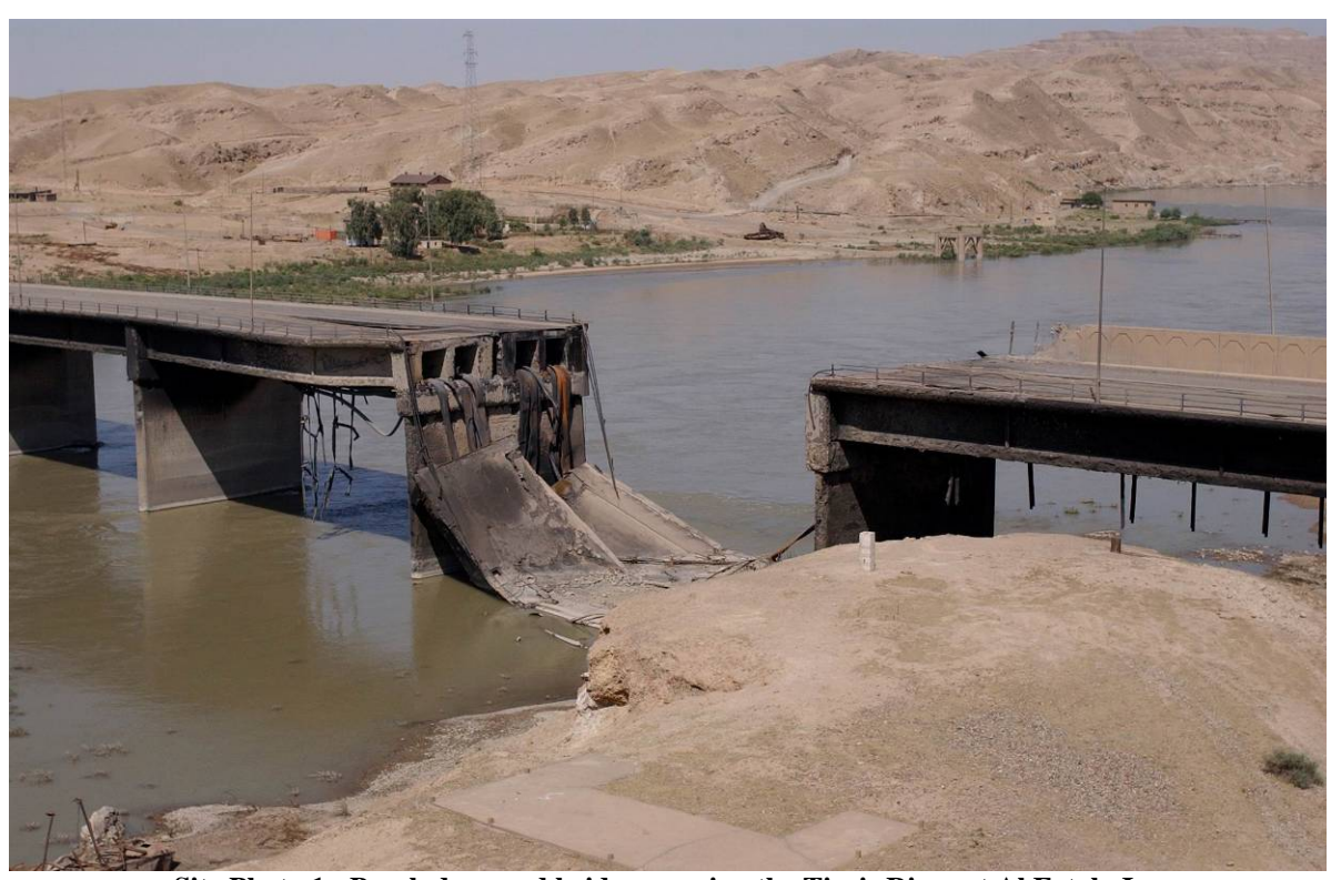
Site Photo 1: Bomb damaged bridge crossing the Tigris River at Al Fatah, Iraq