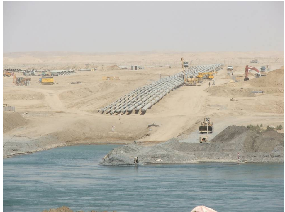
Site Photo 6: Pipes Staged on Tigris East Bank

connect to existing pipelines and to allow for operational contingencies. Site photo 6 shows the nine pipe stings that were staged on the east side of the Tigris River.