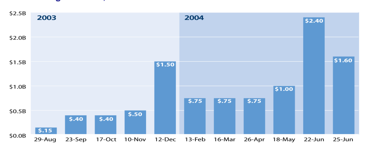
Figure 2—U.S. Currency Shipments of DFI Funds to Baghdad from August 30, 2003 through June 28, 2004

There were 21 U.S. currency shipments from the FRBNY totaling almost $12 billion. Eleven shipments involving DFI funds were made after the CBI's DFI Baghdad account was established in August 2003.<sup>7</sup> Figure 2 provides a listing of these 11 currency shipments totaling $10.2 billion. The CPA's authority to request currency shipments ended when it transferred sovereignty to the Interim Iraqi Government on June 28, 2004.