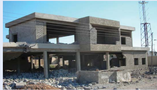
Security issues were major factors in the cost increases and delays in the $345 million U.S. effort to build more than 130 Primary Healthcare Centers in Iraq. The U.S. government did not complete six centers after spending nearly $3 million because explosives destroyed portions or all of the buildings during construction. The $756,000 Hai al-Intisar Primary Healthcare Center (shown above) had to be abandoned when insurgents used explosives to seriously damage the structure. (SIGIR Audit 09-015)