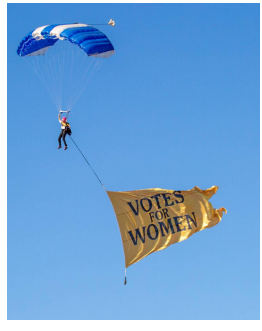
PROJECT 19 SKYDIVERS