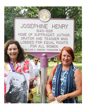
VOTES FOR WOMEN TRAIL