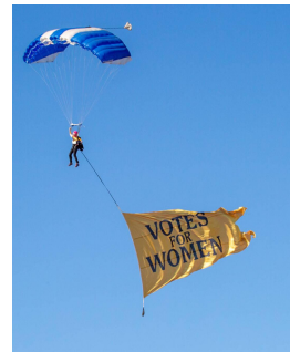
PROJECT 19 SKYDIVERS