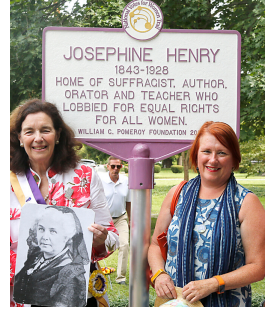
VOTES FOR WOMEN TRAIL