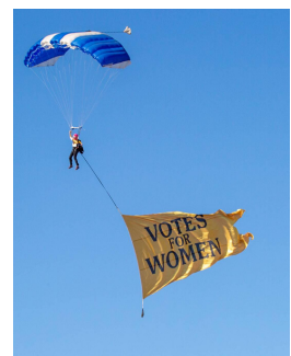
PROJECT 19 SKYDIVERS